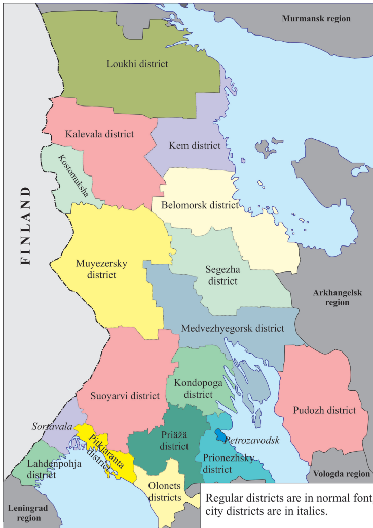
Fig. 1. Administrative division of the Republic of Karelia [29]

Seven of 18 municipalities of the Republic of Karelia lie at the national border (fig. 1).