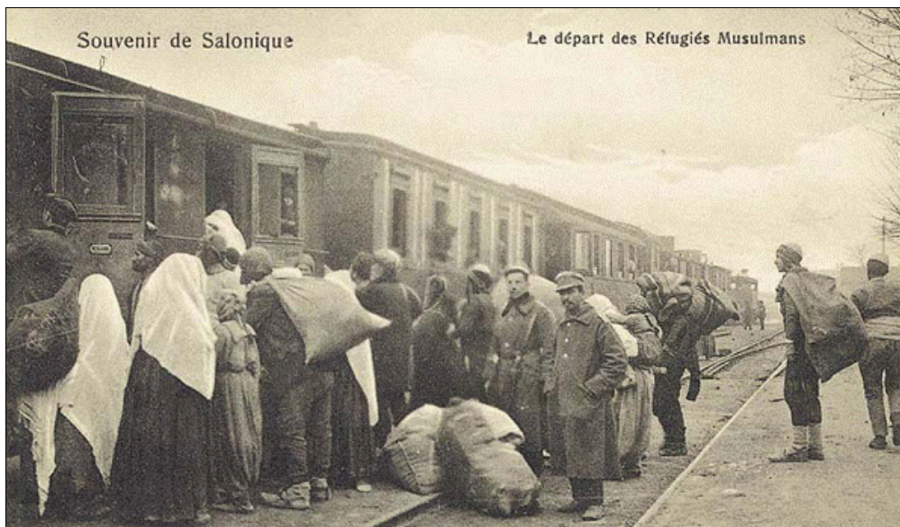
Fig. 4: Muslim-Turks from the Greek Kingdom in 1923.

A note on the Ottoman/Turkish archives is in order. The main problem is the access to some archival holdings; concretely, the Internal Ministry's Immigration Commission Documents (Dahiliye Nezareti Muhacirin Komisyonu Evrakı, DH.MHC) and the Turkish Ministry of Foreign Affairs. The holdings of DH.MHC were recently opened to researchers. The migration policy could thus far only be depicted using documents obtained from the files of other ministries, primarily the Interior Ministry. Although the funds of the Immigration Commission for the republican period have been opened (the Toprak İskan Genel Müdürlüğü Arşivi/General Directorate of Land and Settlement), they have not yet been examined critically in terms of the open-door policy. Moreover, the archives of the Turkish Ministry of Foreign Affairs are not fully opened.