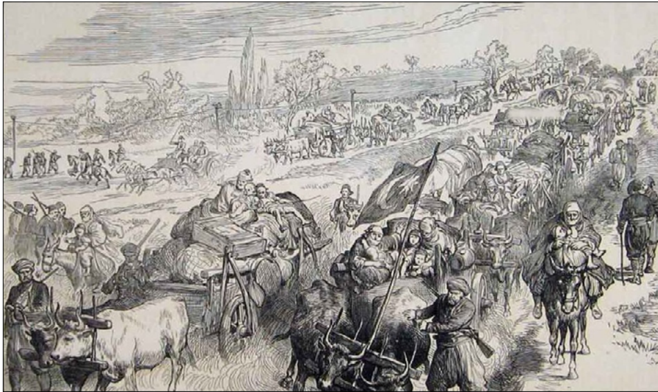
Fig. 2: 1878 Migrants. The Illustrated London News , September 1, 1877, 213.

Epistemological difficulties are due to the limits of terminology, archives, and literature. More specifically, they are tightly tied to the "power" that determines taxonomies and knowledge. The most important term that comes to the fore is muhacir (literally, migrant) which is different from the present-day understanding of the term.