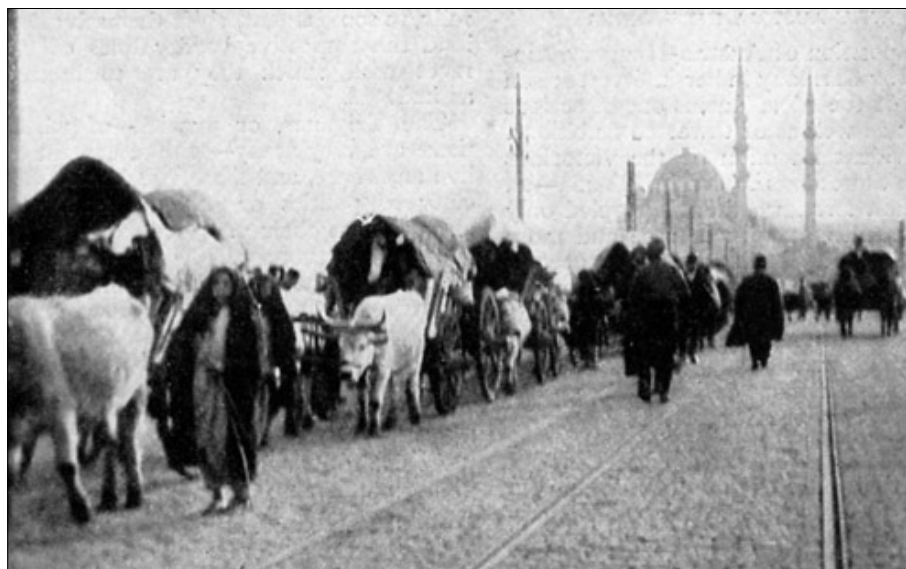
Fig. 3: Iconic photo of 1912 Balkans' migrants. Frederick Moore, National Geographic Society.

and importantly, these researchers fail to take into account the pull factors such as aid and exemptions offered in their not-so-open-door policies. 26 Although these were very generous in the late Ottoman Empire, they decreased in the republican period. This aid included free land and housing in addition to exemption from military service and taxation. 27 This project therefore argues that the ODP itself was a pull factor. Indeed some studies approach the Russian open-door policy and the exemptions it promises as pull factors, 28 although almost none of these studies consider the Ottoman/Turkish ODP as such.