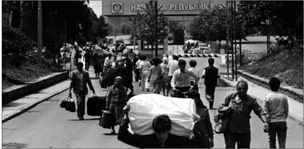
Fig. 5: 1989 Muslim-Turkish Migrants from Bulgaria. Yeni Şafak , November 4, 2019.

migrations from these three regions experienced periods of high intensity, they were spread over a long period. Migrations from Crimea began when the Ottoman Empire ceded Crimea with the 1774 Küçük Kaynarca Treaty. The biggest migration took place during the Crimean War and until 1863. According to Kırımlı, migration lasted until 1944, especially during the years of 1810, 1812, 1816, 1819, 1827, 1856, 1860–62, and 1864–65. 42 The longest-lasting source of migration was the Caucasus, a region Islamised but never fully controlled by the Ottomans. After the suppression of the Sheikh Shamil Rebellion against Russian expansion, the great migration took place in 1864. The second wave took place during the 1877–78 war and continued at a lower intensity until the collapse of the empire. 43 There were also other migrations that were different from preceding ones and had their own ethnic and regional characteristics: Nogay (1859–62), 44 Batumi (Muslim Georgian, 1878, 1914), 45 "Oriental refugees" (1916). 46 The third region of migration was the Bal-