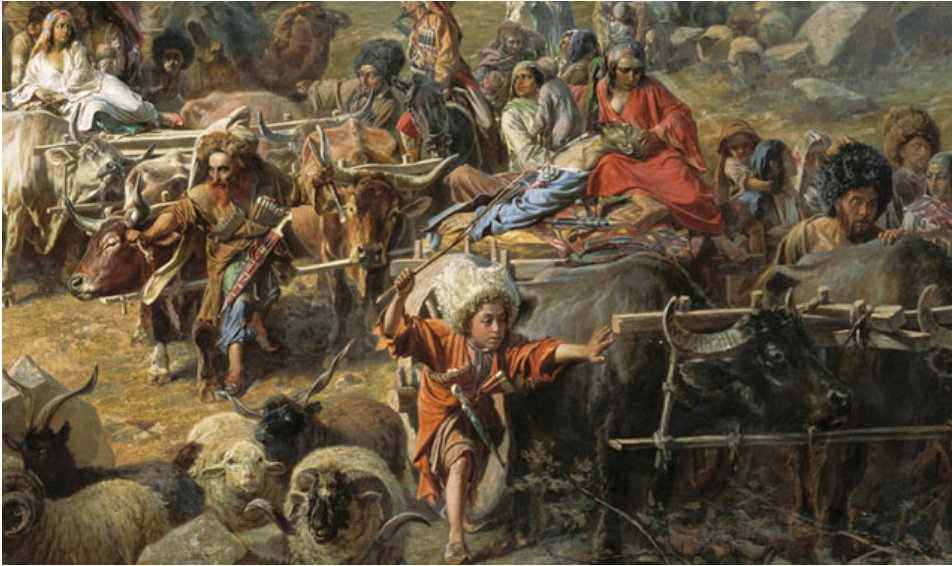
Fig. 1: An iconic paint of the 1864 Caucasian migrants. A section from "The mountaineers leave the aul" of Pyotr Nikolayevich Gruzinsky (1837–1892).

the homogenisation of the country. Most of the literature on Turkish migration (hereafter, literature) mainly argues that the "push factors" dominated, that Ottoman/Turkish immigration policy was shaped mainly by humanitarian concerns, and that the Islamicisation and Turkification policies were their consequences.