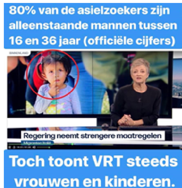
Figure 3. The emotional manipulation by the media over migration, through the eyes of S&V.

Finally, S&V also accuses the media for (mis)representing the movement itself, attacking them for “framing” S&V as a “bunch of racists” (S&V, 2018l, authors’ translation). This is particularly striking in the corpus that covers the period after the VRT Pano reportage (from 05.09.2018 onwards). In a 10-minute video labelled ‘Trial by the Media’, S&V denounces and deconstructs what it describes as misrepresentations, the “frames”, in which the VRT has portrayed S&V, later described as “attempts