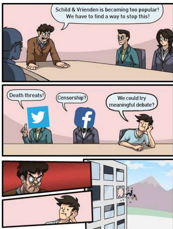
Figure 2. A satirical cartoon over the alleged censorship by social media companies against S&V.