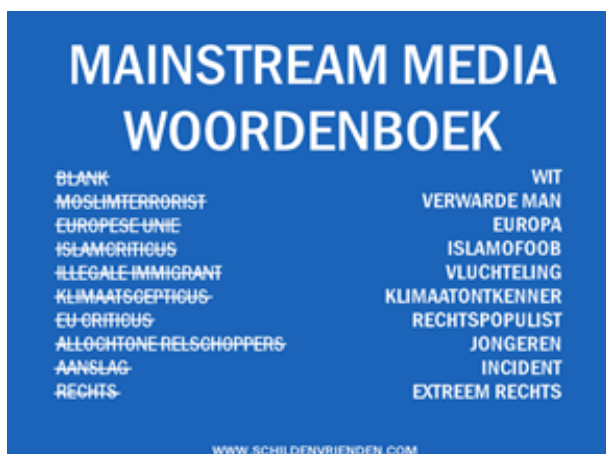
Figure 1. The politically correct dictionary of mainstream media, according to S&V.

In some cases, the mass media and social media platforms are presented as part of the same powerful group