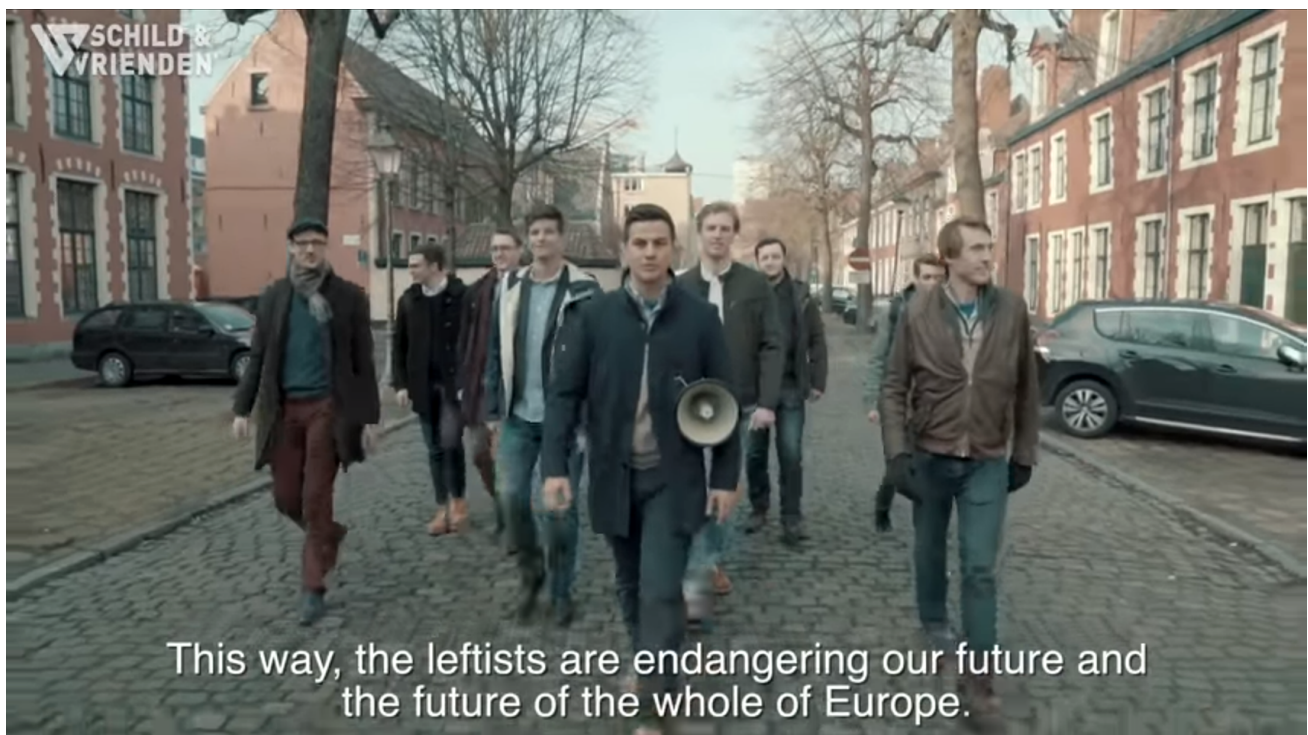
Figure 4. S&V as megaphone of the silent majority.

In his enumeration, Van Langenhove explicitly puts the S&V media channel on a par with running for elections—arguably the most traditional way of politically representing others. But this is not the only instance where media and representative claims are tightly intertwined.