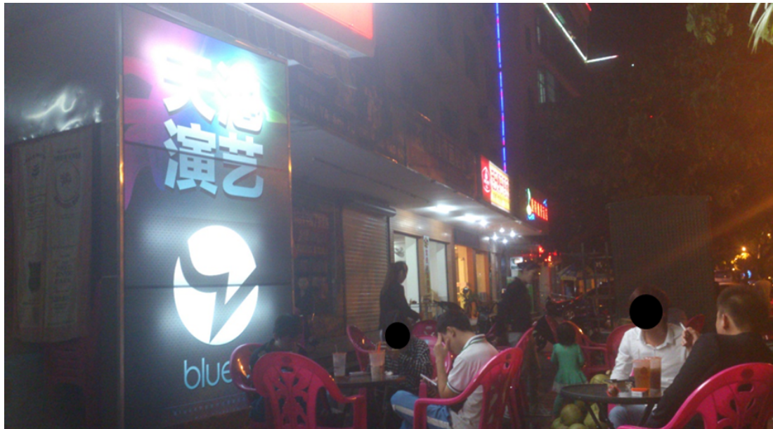
Figure 2. Blued sign outside Tianchi.

before the app became widely known and used, some men in Sanya believed that it was in fact the bar itself that was named ‘Blued.’ For Tianchi, a further benefit of this sign and its inclusion of Blued’s logo was the way in which it tacitly announced the presence of a gay bar without the need for explicit terms to refer to sexuality. In the political and social climate of the PRC, and Hainan in particular, the use of terms such as ‘gay,’ ‘tongzhi’ or ‘homosexual’ in Tianchi’s publicly visible signage could risk attracting unwanted attention from the general public and the authorities. It would also deter local non-heterosexual people from visiting the bar for fear of being seen entering. In this context, the illuminated logo of an app catering to men who desire men turned Tianchi into a visible non-heterosexual space while ensuring that it was visible as such only to those familiar with Blued.