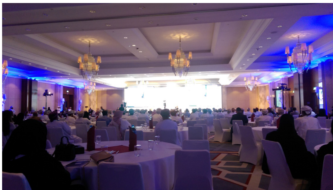
Figure 2. Arab Region Cybersecurity Summit 2017.

Despite their similar content to the hacker conferences described by Coleman—malware analysis, details of vulnerabilities, stories of famous hacks, and so on—cybersecurity conferences appear to have as much in common with the drab medical gatherings to which she juxtaposes the hackers’ “ritual celebration”. The cybersecurity conferences I attended were held in luxury hotels, with high-quality food and drink available throughout. Formal dress was required (Figure 2). As is the case for cybersecurity and technology sectors more generally, there were far more men than women at these