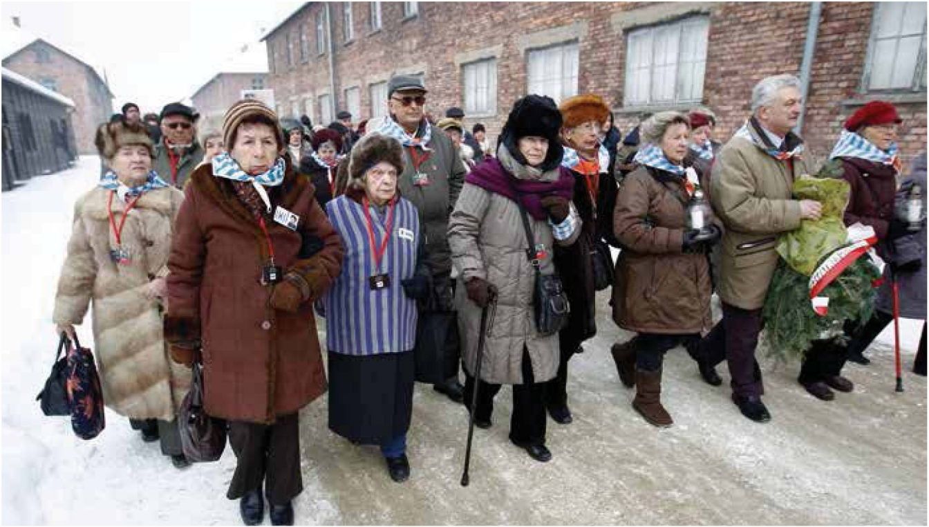
Former prisoners arrive to lay wreaths and flowers at the “death wall” of the Auschwitz concentration camp on International Holocaust Remembrance Day.

the vulgar language of medieval anti-Semitism. Symbolically, the Star of David is tied to the gate of the brothers’ house, thus branding them “Other” too. Using premodern language and basing their actions on morality, the brothers then proceed to seek out the mass grave of the Jews. They do not use the language of academic study or of human rights; rather, they seek to formulate an answer to medieval anti-Semitism at the same conceptual level. In the film, the unspoken, non-verbal, and unnamed event is the murder of the local Jews. By speaking in a visual and moral language that lies outside modernity and secularism, the film is able – from the inside – to give a name to the event and then to determine the responsibility of the villagers. It is this interiorized religious and moral sense of responsibility that the film speaks of, using post-secular language.