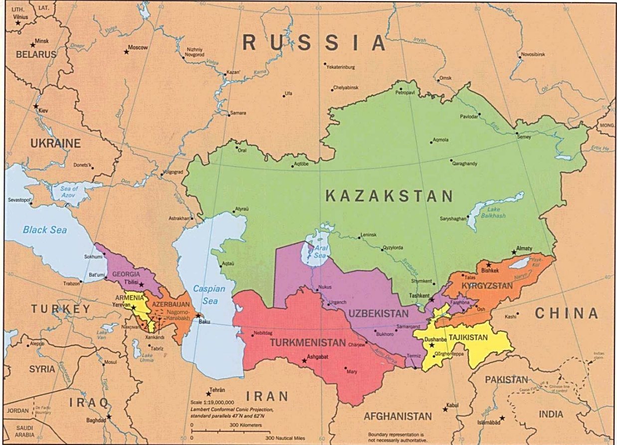
The Caucasus and Central Asia