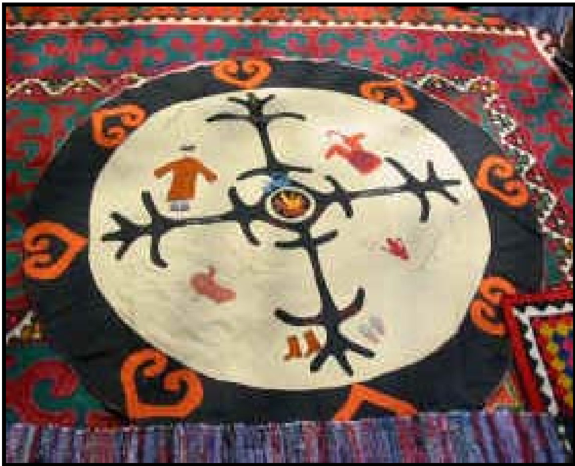
A Kyrgyz Table Cloth: One side depicts a woman, the other, a man. On her side is a cooking tool and on his, a saddle.

Women's Oral Histories from the Former Soviet Union