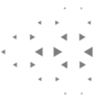
Table 3 (continued)