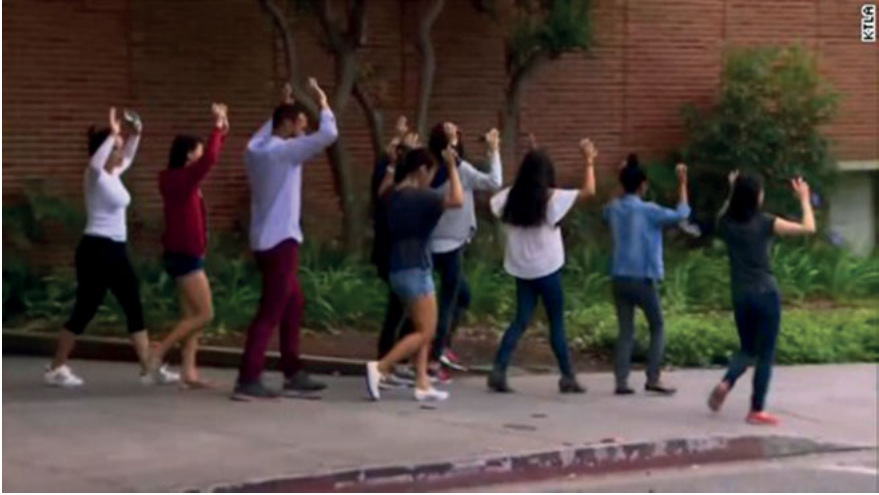
Fig. 4: Students with hands up on UCLA campus [public domain].

In addition to shutting down the campus for two hours, police searched every student carrying a backpack, which as we all know means almost every student on campus.