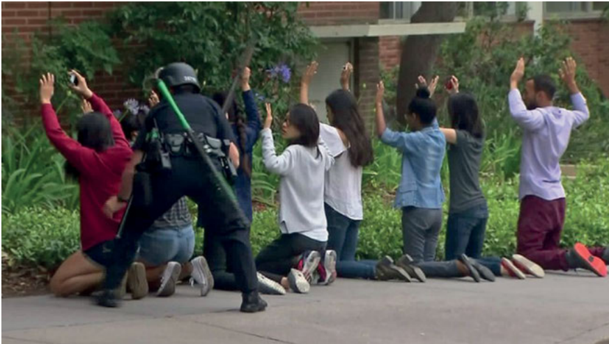
Fig. 6: Students with hands up on their knees being searched by police on UCLA campus.

In retrospect this response proved to be massively disproportionate to the threat, which ended when the murderer, a former graduate student, killed himself after killing his advisor. Of course, one might argue that because there was no way to know this at the time, it was better for the police to be safe than to be sorry. And this argument makes a certain kind of practical sense. But what I find most troubling about this event is not the murder itself, as tragic as it was, nor the threat of future murders with greater numbers of victims. No, what is most troubling to me is the fact that such a massively militarized law enforcement infrastructure pre-exists and that the authority of the police to take complete control over any public space, including a college campus, is undisputed, particularly when, as was the case in this incident, every student on campus is transformed into a potential suspect.