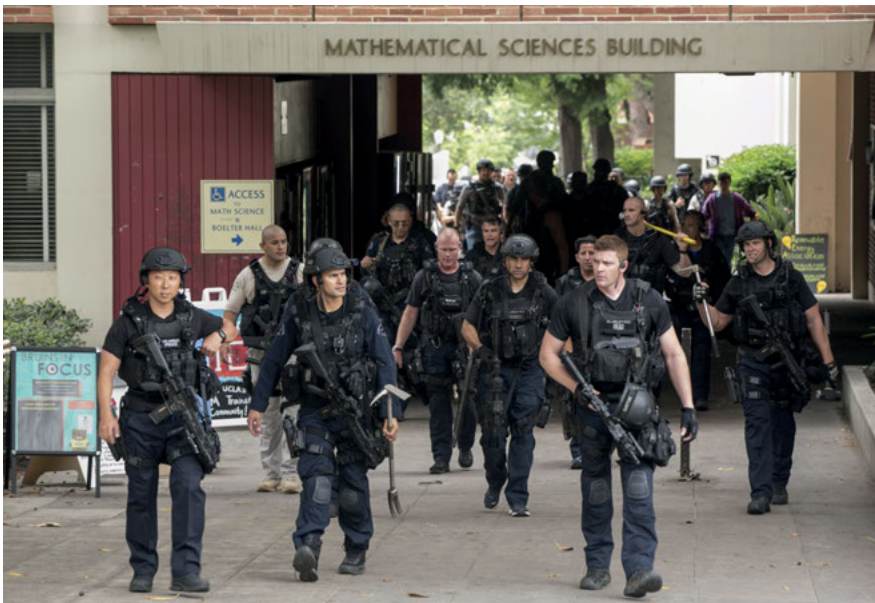
Fig. 3: Police officers in riot gear on UCLA campus [public domain].

Police officers in riot gear ran across campus, guns and battering rams drawn, while students exited buildings with their hands above their heads.”