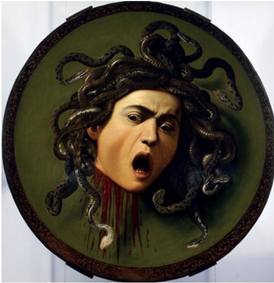
Fig. 3: Michelangelo Merisi da Caravaggio, Medusa (1597). Le Gallerie degli Uffizi, Florence.