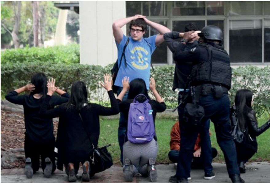
Fig. 5: Students being searched by police on UCLA campus [public domain].

In addition to shutting down the campus for two hours, police searched every student carrying a backpack, which as we all know means almost every student on campus.