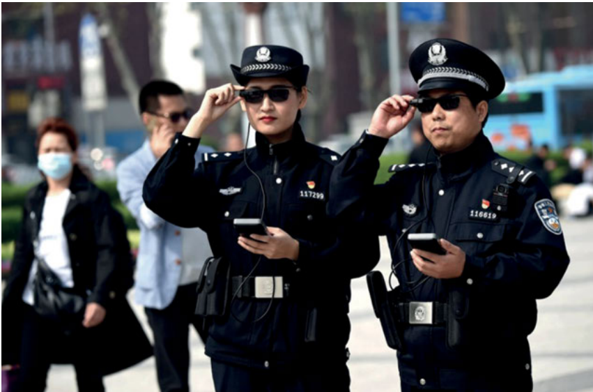
Fig. 2: Chinese Police wearing A.I.-powered smartglasses.