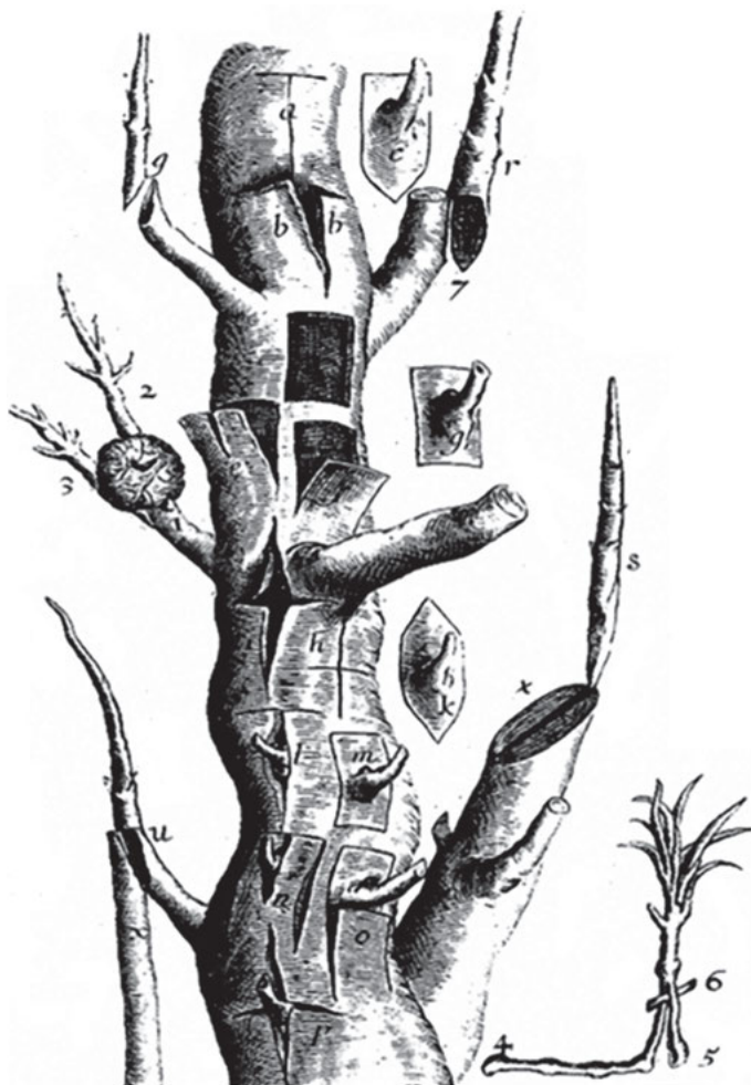
Fig. 1: Robert Sharrock, various methods of grafting, in: The History of the Propagation & Improvement of Vegetables by the Concurrence of Art and Nature , 1659, p. 59.

becomes what Foucault calls a dispositif [device] (Foucault 2004, 70). What is at stake here are natural resources that can be controlled and even improved by grafting or hybridization with the aim of economic exploitation. This is also the way to overcome the nature/culture split: The total, or even totalitarian economic framing of everything we refer to as nature puts nature at our disposal and into a 'stand-by mode' – what Martin Heidegger referred to as " Bereitstellung " [state of preparedness] (Heidegger 1967, 16). This stand-by mode is the very basis of what is called biopower (Foucault 1984, 257; Bertilsson 2003, 120).