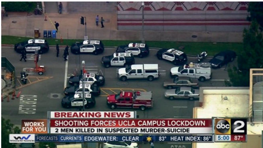
Fig. 1: Police force assembled on UCLA campus [public domain].

I want to close by briefly addressing the overwhelming show of militarized police force that occurred in response to a murder-suicide at UCLA, on the first of June, 2016, as a way of underscoring my concern that securitization is as much or more to be feared than the acts of criminal violence that are lumped under the rubric of 'terrorism.' For those not familiar with this event, at around 10:00 AM police received the first of several 911 emergency calls reporting three shots fired and possible victims.