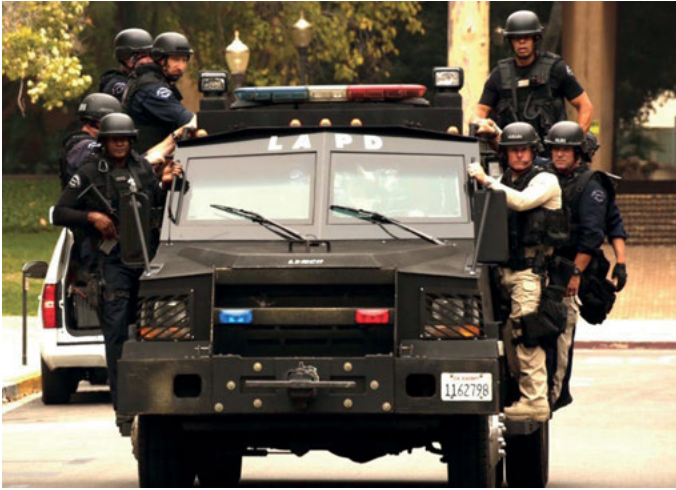
Fig. 2: Militarized police vehicle on UCLA campus [public domain].

Police officers in riot gear ran across campus, guns and battering rams drawn, while students exited buildings with their hands above their heads.”