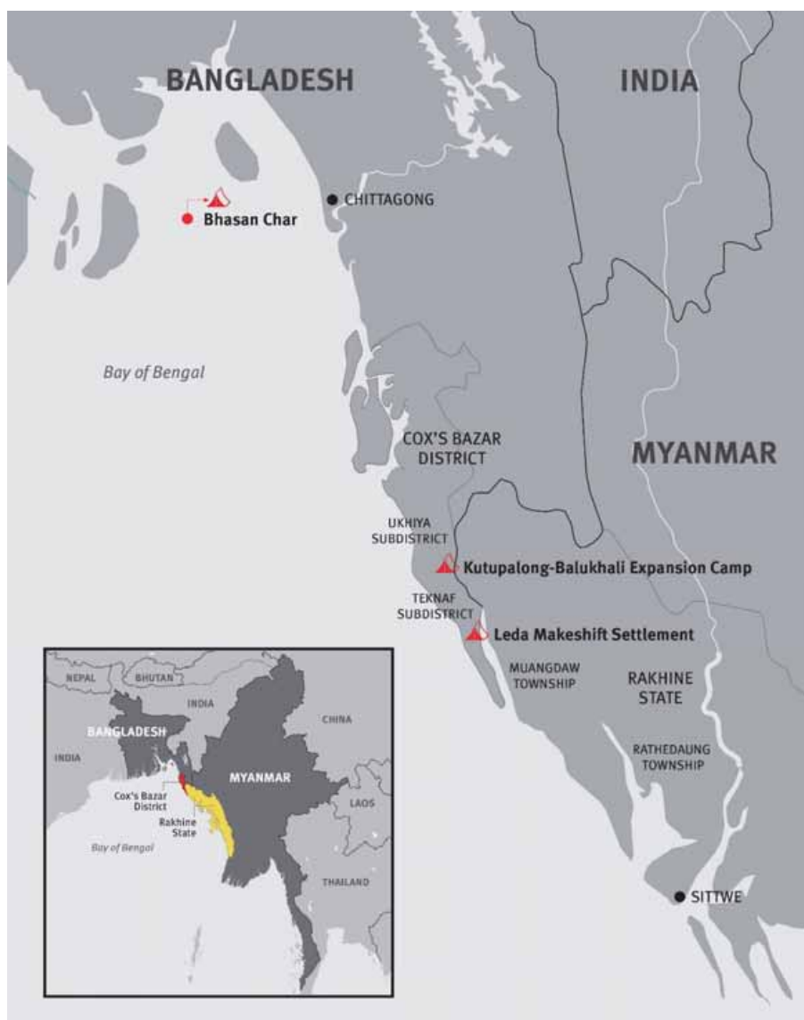
Figure 1 Map of Cox's Bazar, Bangladesh