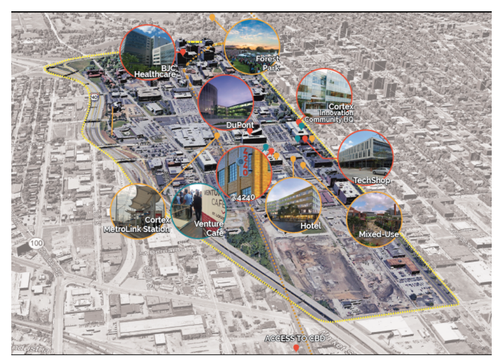
Figure 2. Cortex Innovation Community (Cortex; Saint Louis, MO). As a legal entity, Cortex was established in 2002 following a series of attempts to create a research corridor between St. Louis University, Washington University, and BJC Healthcare research medical center. In 2010, Cortex was reimagined as an innovation district and renamed the Cortex Innovation Community. Incubators, hospital and university anchors, boutique hotels, and open spaces for quick wi-fi connectivity are all located within the designated space (Drucker et al., 2019).