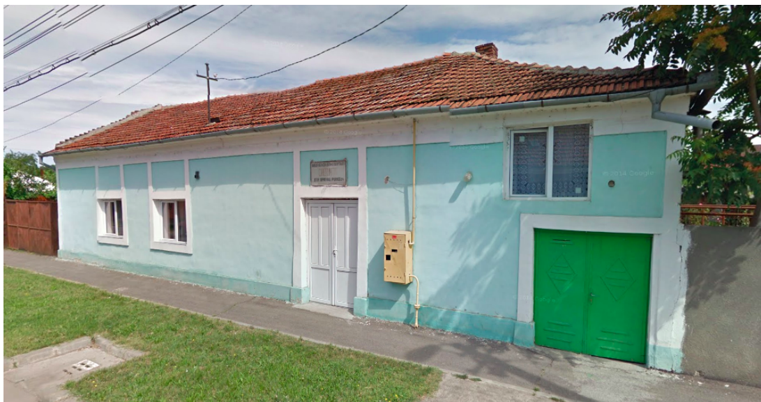
Figure 3. Faith Church in Arad-Sega in 2014.