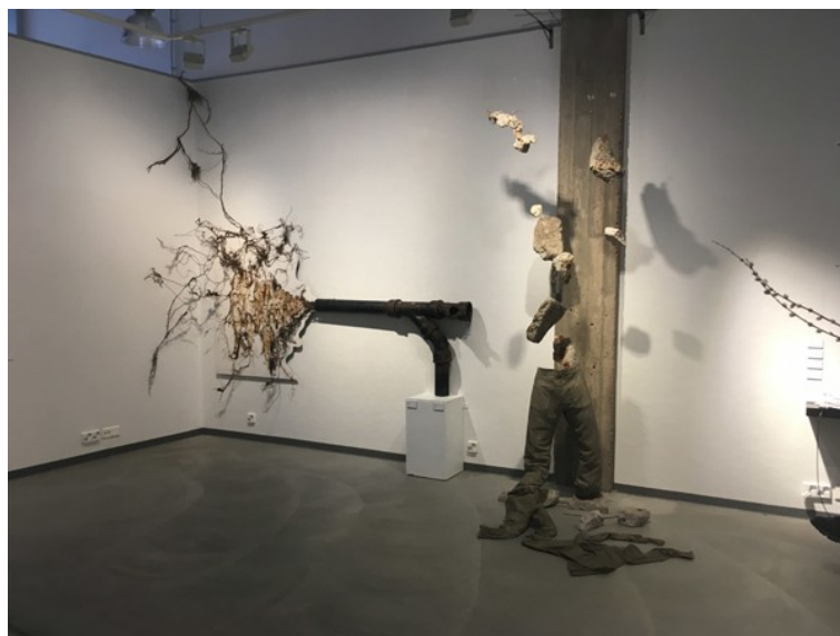
Figure 8: Participant 4 and 5's works, "Rauhaton/Impaziente/Restless" on the left and "Kuuluminen/Appartenenza/Belonging" on the right [58]

Although both works are independent, they settled in an interesting dialogue in the exhibition, where they were placed next to each other. In these artworks, the artists' personal experience and their trauma from the loss of home and second home can be seen as comparable to the general conflicts of the world and to other similar situations in which natural disasters, wars and conflicts destroy homes and drive people away from the places where they feel they belong. All these create homelessness, rootlessness and situations in which people struggle to belong.