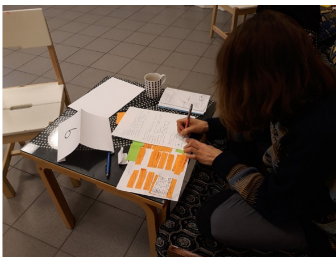
Figure 2: Ideation in the video workshop [22]

Seven of the participants finished their short films, the styles of which range from an experimental short film to a documentary that combines observational and participatory modes. The films' themes include the bodily sense of belonging, belonging through music, olfactory memories of home, belonging by learning to cycle, defending a doctoral thesis in order to belong to academia, adaptation to a new culture, and the feeling of non-belonging (HILTUNEN, 2019b).