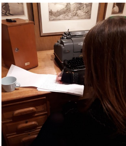
Figure 3: Individual work in the writing workshop [25]

The group worked dialogically and collaboratively, sharing ideas, feedback and thoughts, and helping each other to construct the final products. Help was provided in visualizing, filming and translating. As a result, short stories, visual and textual poems, autobiographical writings, sound and video poems, a filmic short story, a politically engaged video, paintings and sculptures were created. The meanings of belonging were further explored in the public events organized by the workshop. Two literary nights featuring the workshop participants' live readings and the premiers of the sound and video poems were organized as part of the workshop. The audience also had the chance to share their ideas on belonging. These events based on bodily presence enabled the participants to share experiences on a personal level.