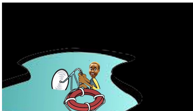
Figure 6: Participant 2's short film (a screenshot) [43]

In her film, she relived the experience. The narrative consists of images of Participant 2 and her friend riding a bike slowly and carefully, accompanied by Participant 2's voice-over. The most challenging part of the production process for her was to make the story funny and to convey to the audience a sense of joy. Finding the right tone and attitude for the voice-over was crucial and she worried about this a great deal. With a deadpan style, however, she managed to make the audience at the premiere laugh. In the film, just before the accident there are animated elements to enliven it, such as the text "Very bad idea," making it tragicomic. The figure of a flying Finn comes and whisks her home. In the end, the voice-over comments that she has realized that she does not need cycling in order to belong, that there are other ways of belonging. Participant 2's positive stance toward belonging is also revealed in the way she saw the project through. Two other participants helped her with the filming, animation and editing. By reliving the cycling experience, she challenged herself even further: making the film encouraged her to practice cycling again: "I stepped out of my comfort zone, challenged myself. It helped me in some practical ways."