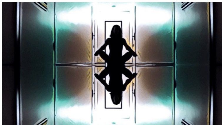
Figure 7: Participant 3's short film (a screenshot) [49]