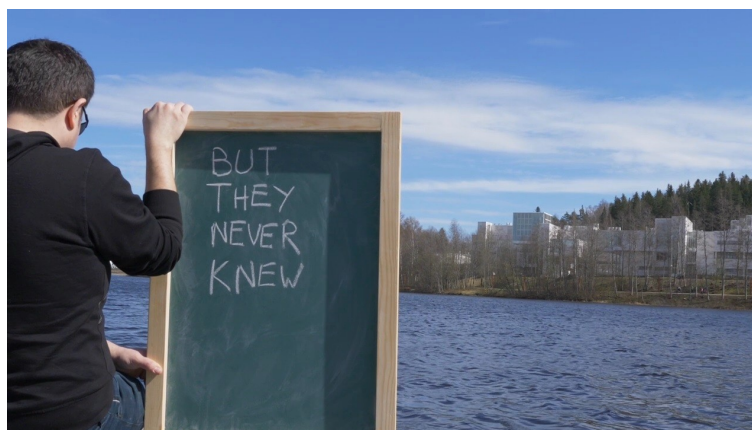
Figure 9: Participant 6's video (a screenshot) [67]

Art-making may not lead to answers, but it may offer an opportunity to process unaddressed aspects of one's life and open up spaces for others to pose their own questions. Participant 6's work suggests that the creative process is more important than the finalized work of art, providing ways of knowing what belonging is rather than knowledge about belonging.