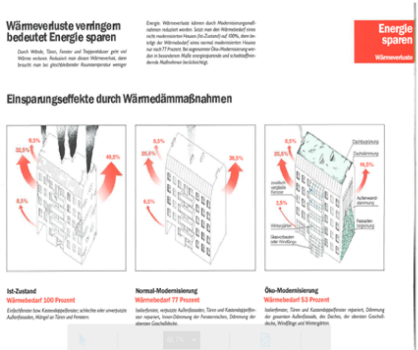
Figure 6. Information leaflet explaining cost savings through the sustainable urban renewal measurements.

Before analysing the essential communicative tool of inhabitant representation ( Betroffenenvertretung ), it is important to consider the social structure of the affected neighbourhoods. The social composition was pri-