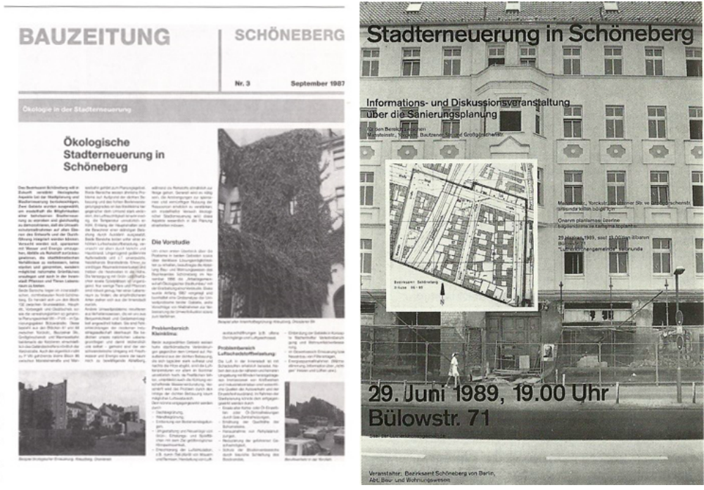
Figure 5. From left to right: Newspaper article about sustainable urban renewal within the redevelopment area and invitation leaflet for the second consideration meeting.

ducted surveys through sending questionnaires, which were distributed to the households as well as on-site visits with inhabitants. Within this particular format of public communication, visualisations did not play a significant role. As such, data reports for the planning and political authorities were shaped more by planners' vocabu-