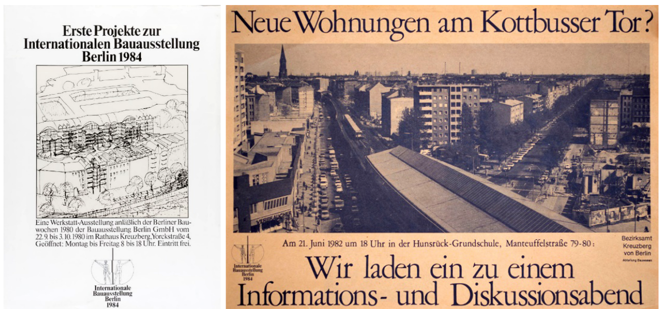
Figure 3. From left to right: Posters of the international planning exhibition in Kreuzberg inviting the public to a workshop exhibition in 1980 and an assembly in 1982. Sources: “First Projects for the International Building Exhibition Berlin 1984” (1980) and “New apartments at Kottbusser Tor?” (1982). Image rights: S.T.E.R.N. Gesellschaft der behutsamen Stadterneuerung mbH.

Adapting the prior mentioned legal planning regulations in designated areas, a comprehensible and citizen-