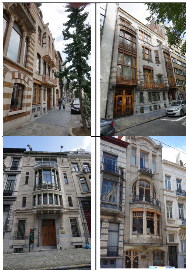
Figure 2. Different Art Nouveau buildings in Brussels

heritage-tourism nexus only allows a limited number of creative solutions.