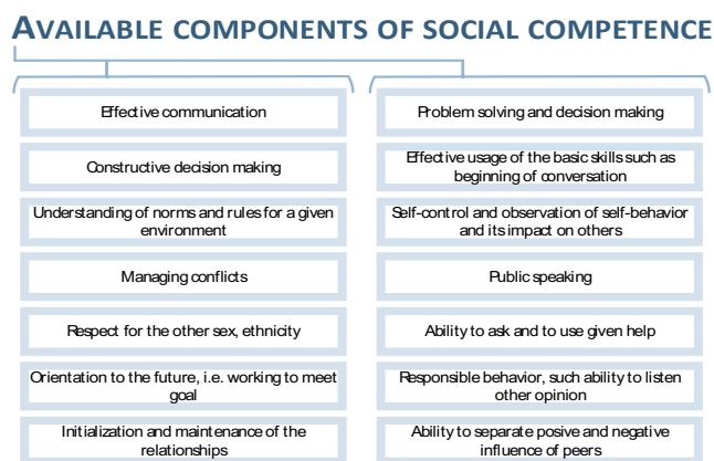
Figure 1. Available components of social competence

Social competence in a narrow sense is what helps people to adapt more easily to communicate and interact with each other and in cooperation activities. In a broad sense - the ability to acquire the right profession, activity in the labor market, purposefully develop careers and feel happy. Therefore, social competence skills are specific to social competitive, continuous learner and developing citizen. All these elements of social competence are developed through lifelong learning (LLL). Some of them are provided in the Figure 1.