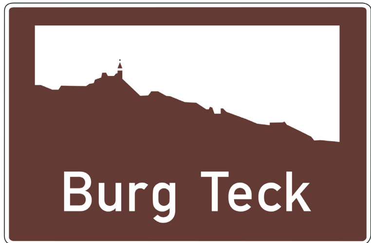
Figure 1: Sample sign

With the help of touristic brown signs, travellers on Autobahns are supposed to be informed about sights, cities and landscapes (Points of Interest, PoI) past which they are travelling. The signage, which has existed in Germany since 1984, is regulated [25] under the Road Traffic Act and the Guidelines for Touristic Signage (figure 386.3). It points out destinations that are either visible from the Autobahn or are in principle less than 10 km (as the crow flies) from an Autobahn junction. In exceptional cases, linear distance may be further afield than this and more than two signs may also be erected between two nodal points. These signs typically feature a symbolic representation of touristic attractions or geographical objects accompanied by a short description (see Figure 1) [13].