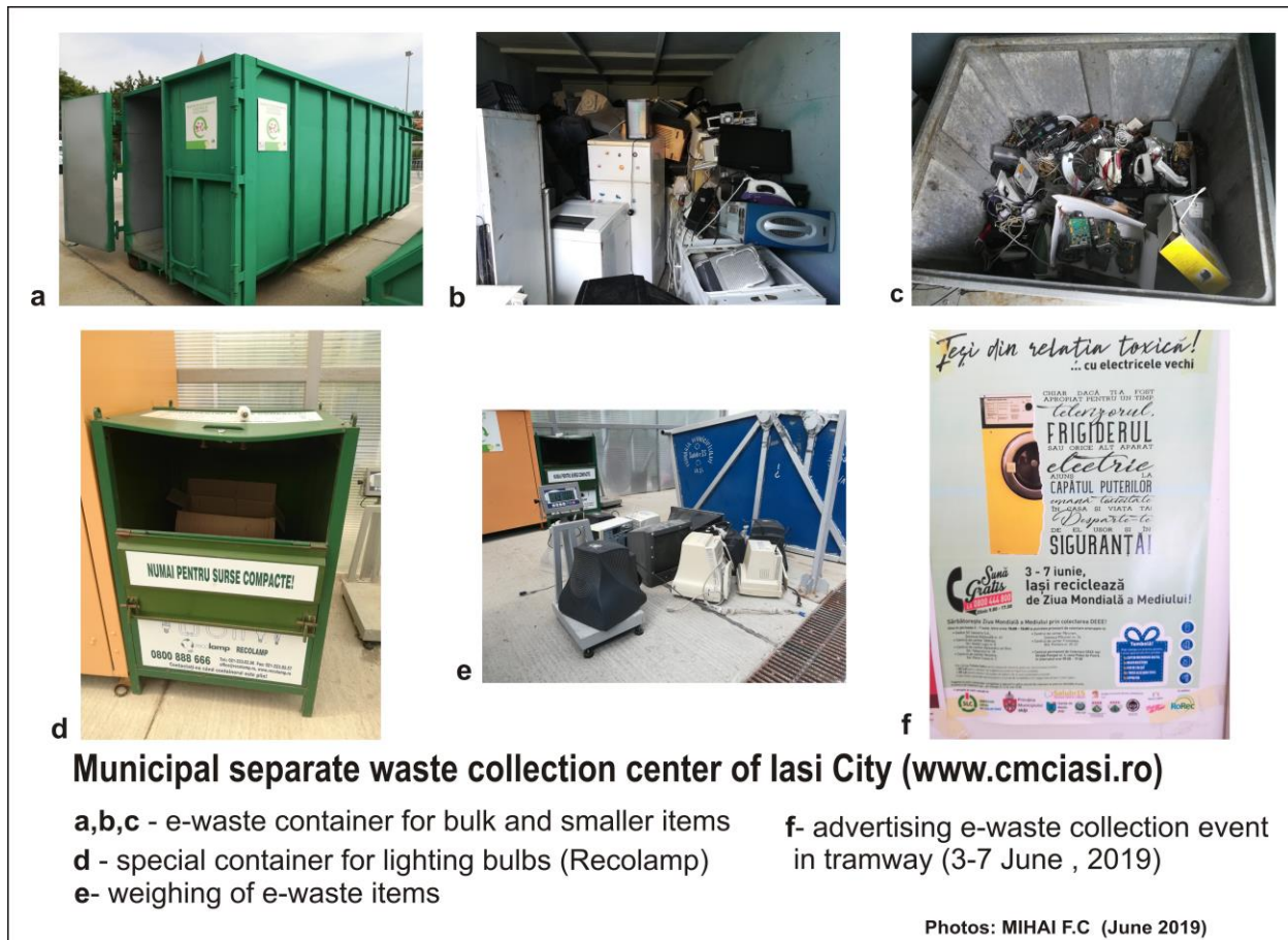
Figure 3. E-waste collection facilities within collection center of Iasi City

The recyclables are sorted, counted and weighed automatically and users receive a bounty depending on the types of waste and their quantities. The wastes collected are further sent to specific recycling companies. This system derived from a collaboration of various stakeholders such as private sectors (retailers, Green Group, Econpaper, Romcarbon SA) Ministry of Environment, local authorities and recycling companies. Sigurec Prime is a smart collection station for recyclables (plastic bottles, plastic bags, paper and cardboard, polystyrene, another packaging) which include also the ESCALE machine for e-waste (lighting bulbs, batteries). Sigurec In - These are interior machines, which can be found in large retail outlets where some e-waste items could be also collected. SIGUREC systems collected 14 136.81 t of e-waste so far and these collection stations are available in several urban areas ( https://www.sigurec.ro/ro/locatii-sigurec ).