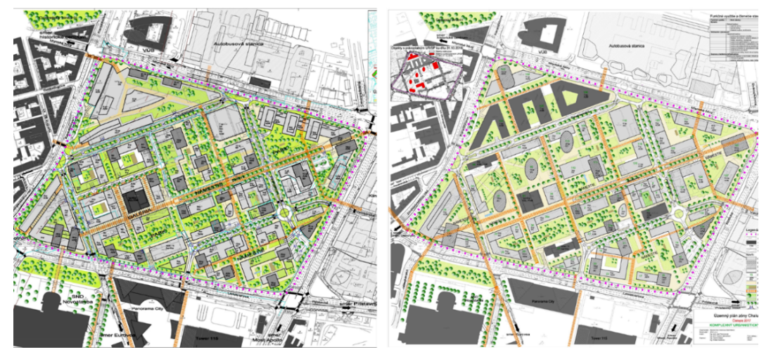
Figure 1. From left to right: The urbanistic study 2008; the approved zonal plan 2018.

In parallel to the compilation of the planning documents, the real estate developer organized an open private architectonic competition for the site between 2008 and 2010. The competition attracted some of the internationally well-known architectonic ateliers. The winning proposal, designed by Zaha Hadid architects, suggested amorphous solitaire towers for the site (see Figure 2). However, these became a central issue within negotiations between the investor and the urban planners, as the city's land use plan favoured here compact blocks of houses. This mismatch was raised by several urban planners, who openly questioned whether the final proposal is in line with the city's land use plan. They also admitted that the architect's celebrity reputation partly served as a powerful tool in the decision-making process. The role of urban planners has, according to some respondents, shifted from planners to lawyers due to