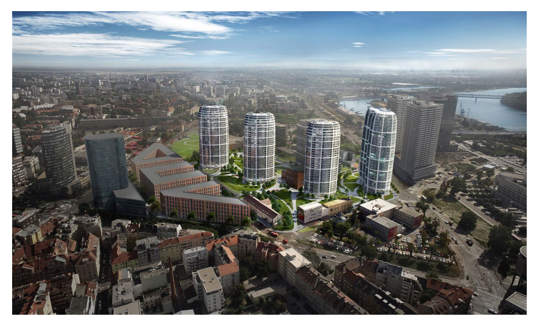
Figure 2. Visualisation of the Sky Park project.