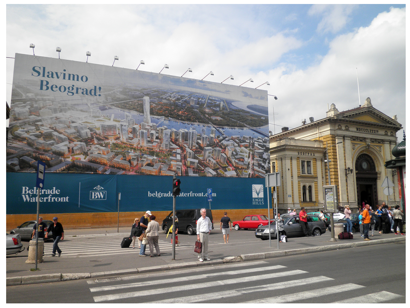
Figure 4. A billboard close to the construction site, advertising the project.

public several months later after on-going demand for more transparency regarding the project, Eagle Hills largely provides the financial 'inputs' along with dictating the urban design as well as the marketing and sales strategies, while the Serbian state was required to enable any means necessary for implementing the project. Decontaminating the soil and preparing the basic infrastructural utilities on the construction site are examples of the latter, alongside the aforementioned institutional and regulatory adjustments. Additionally, it appeared from the contract that the investor is leasing the nearly 80 hectares of land for a period of 99 years (Belgrade Waterfront Company, 2015; Grubbauer & Čamprag, 2018).