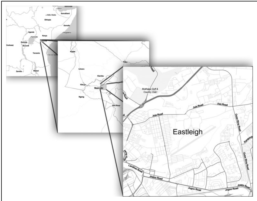
Figure 1. Location of Eastleigh.

enumerators, all of whom were local Eastleigh residents, consisted of eight individuals balanced by gender and religion.