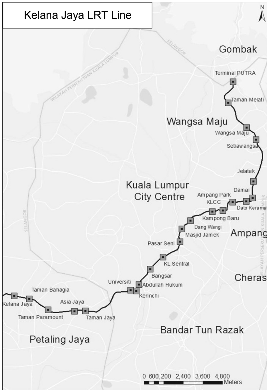
Fig.1 The study area