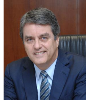
Mr Roberto Azevêdo

This volume is the sixth in a series of annual publications from the World Intellectual Property Organization (WIPO) and the World Trade Organization (WTO). Prepared by the WIPO-WTO Colloquium for Teachers of Intellectual Property, this collection of academic papers represents an important contribution to international scholarship in the field of intellectual property (IP). Today we witness ever increasing, more diverse forms of international interaction on IP, yet equally we see growing attention to differing national policy needs and social and developmental priorities in this field. The Colloquium Papers series highlights the importance of fostering scholarship in emerging IP jurisdictions, harvesting the insights from policy and academic debates from across the globe, and promoting mutual learning through the sharing of research and scholarship on a broader geographical base.