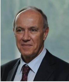
Mr Francis Gurry