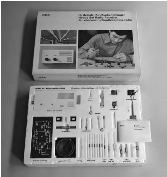
[Figure 2.1] The Hobby Set Radio Receiver design by Dieter Rams and Jürgen Greubel, 1967.

the technically interested and capable teenager. Contemporary flat design, on the other hand, incorporates design elements for a much younger age group. Its colorful surfaces, big typography, and animated characters are generally design elements used for targeting children aged two to seven—a time during which children are in the sensorimotor stage. Children in this stage, as the child psychologist Jean Piaget has shown, assign active roles to things in their environment (animism), while their activities are mainly categorized by symbolic play and manipulating symbols. It is a stage in