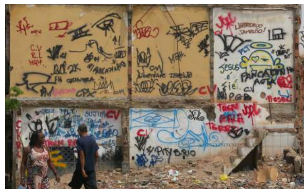
Figure 4. CV tags on home exteriors, Manguinhos, 2015.

Even before the favela’s takeover by the UPP, a large-scale urbanization project was well underway to redevelop the area that surrounds Manguinhos leading up to the Maracanã Sports Stadium. Funded by PAC, the urbanization project began in 2008 and is coordinated by the State Ministry of Works (Seobras), in partnership with Emop. According to the State Department of Finance, the total PAC investment between 2008 and 2010 was around R$ 3.1 billion (US$ 1.6 billion). Among the works delivered in 2009 was a 35,500 square meter Civic Center located on the grounds of a new mid-rise housing complex built on the grounds of the old Army Supply Depot (DSUP). The Center included a library (with a theater and cinema), a recycling facility, an ‘income generation center’, a health clinic, a women’s social service center, a legal aid center, a sports court, and a high school attached to a swimming pool known as the ‘Manguinhos Water Park’ [136].