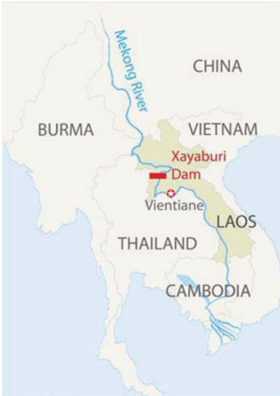
Figure 1. Xayaburi: The First Mainstream Dam in the Lower Mekong

On 7 November 2012, Laos organised a ground-breaking ceremony for the 3.7 billion USD Xayaburi Dam on the Mekong mainstream. This specific multibillion-USD hydropower project holds extraordinary diplomatic relevance, as evidenced not only by the large number of newspaper and magazine articles – the search term “Xayaburi Dam” returns more than 60,000 results on Google – but also by the academic research carried out by political scientists, who have focused on the political dimension of the problem – see, in particular, works by Cronin and Hamlin (2012), Thabchumpon and Middleton (2012), Geheb, West and Matthews (2015), Hensengerth (2015), Mirumachi (2015), and Suhardiman, Giordano, and Molle (2015).