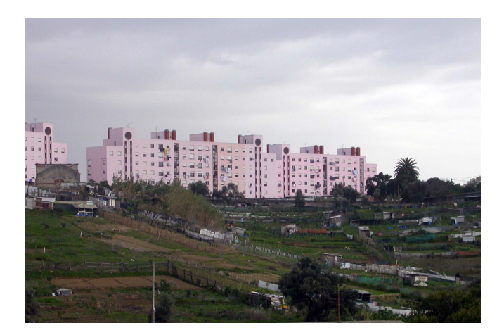
Figure 1. Community gardens in the north of Lisbon (Portugal).

As regards leisure, enjoyment and pedagogical purposes, this is the case of Paris with its collective gardens (in French: jardins partagés ; [9]). There are more than one hundred collective gardens in Paris, situated next to residential buildings and in public parks and schools, all of which are encouraged by town authorities. These are places which foster social interaction, but which also help people to re-establish a relationship with cultivated and natural environments. They can also provide opportunities to develop professional skills and often represent a lifeline for marginalised populations.