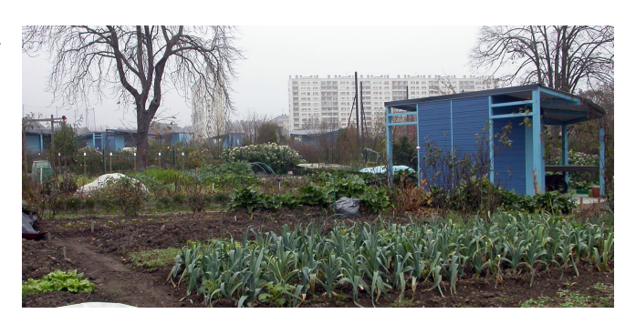
Figure 3. Community gardens in a public park, in the center of Angers (Loire Valley, west France).