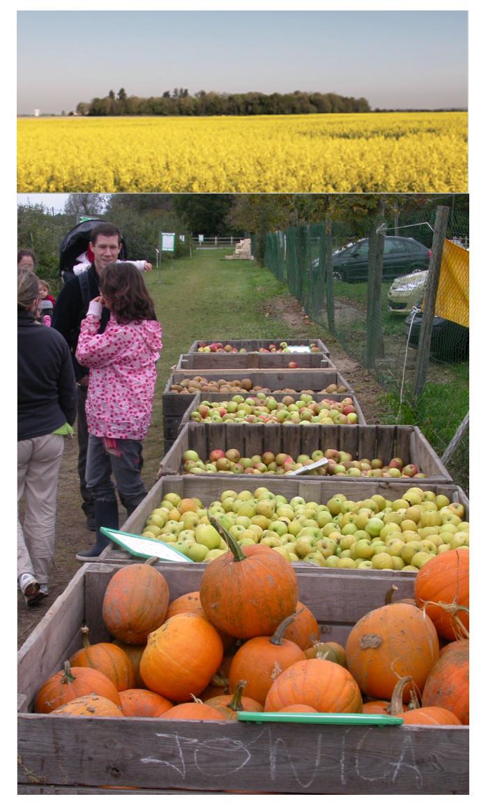
Figure 4. "The Plateau de Saclay", near Versailles (France), rapeseed crops and orchards.

They adopt different forms according to local histories. On the Saclay plateau to the West of Paris, near Versailles, 2,000 hectares of private agricultural land farmed by 12 farmers have been protected from urbanisation (listed under a law for the protection of sites) in 2000 (Figure 4).