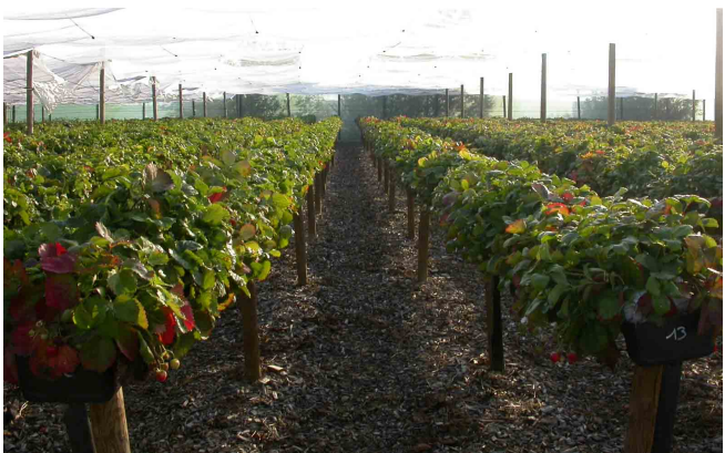
Figure 5. Gally farms, near the Castle of Versailles. Strawberry crops under shelter.

These new commons designate agricultural spaces which are usually private and the agricultural use of which is decided by, and for, local stakeholders and inhabitants who support their preservation. These spaces are similar to classic "commons" because they can be exhausted as a result of urban sprawl, but they are different in that they are appropriated. It is therefore common action which produces the common and not the over-abundance or inability to appropriate the resource (such as the air or the sea). Therefore, a soil, the function and agricultural uses of which fulfil eco-systemic functions (production, regulation, transmission) recognised as useful by the inhabitants, becomes a common.