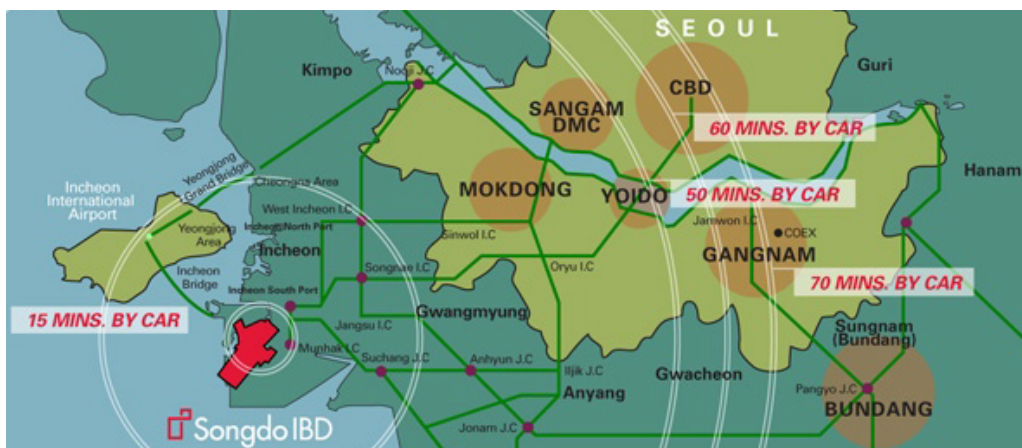
Figure 5. Commuting to Songdo by car.