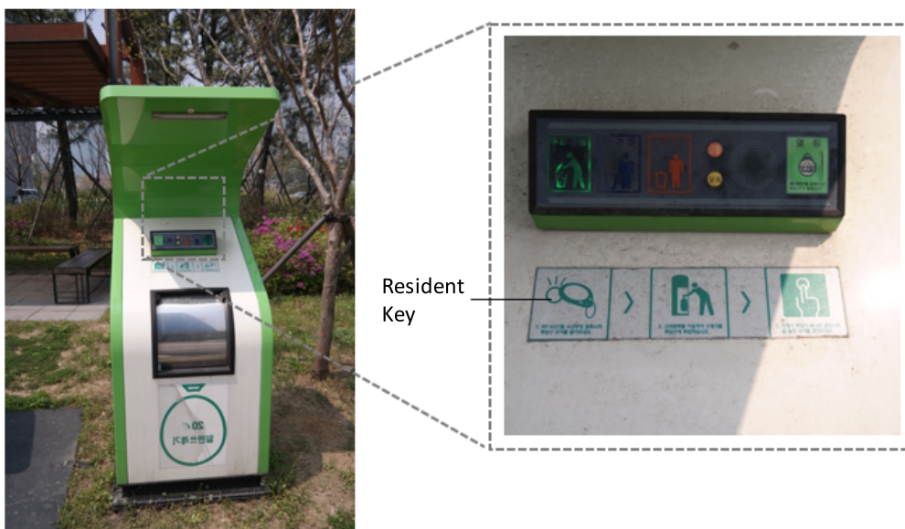
Figure 3. Photo of street-accessed waste bin system. Source: Author (20 February 2015).

In the case of universities, Sonn et al. observed that creating "a new Korean university is still forbidden, but a new campus of an existing Korean university is allowed" (Sonn et al., in press, p. 10). As of 2016, three existing Korean universities have established secondary campuses in Songdo: Incheon University, Incheon Catholic University, and Yonsei University. For instance, from 2013, Yonsei has made it compulsory for all first-year students to attend and live on the Songdo international campus (IFEZ, 2014). Despite an influx of students, a lack of amenities that students are typically accustomed to in Seoul has