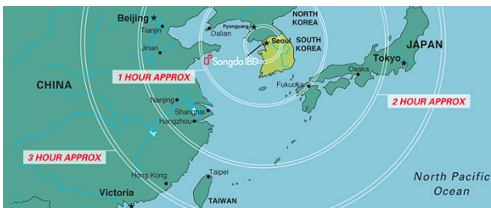
Figure 2. Location Map of Songdo (Songdo IBD from 2015), South Korea.