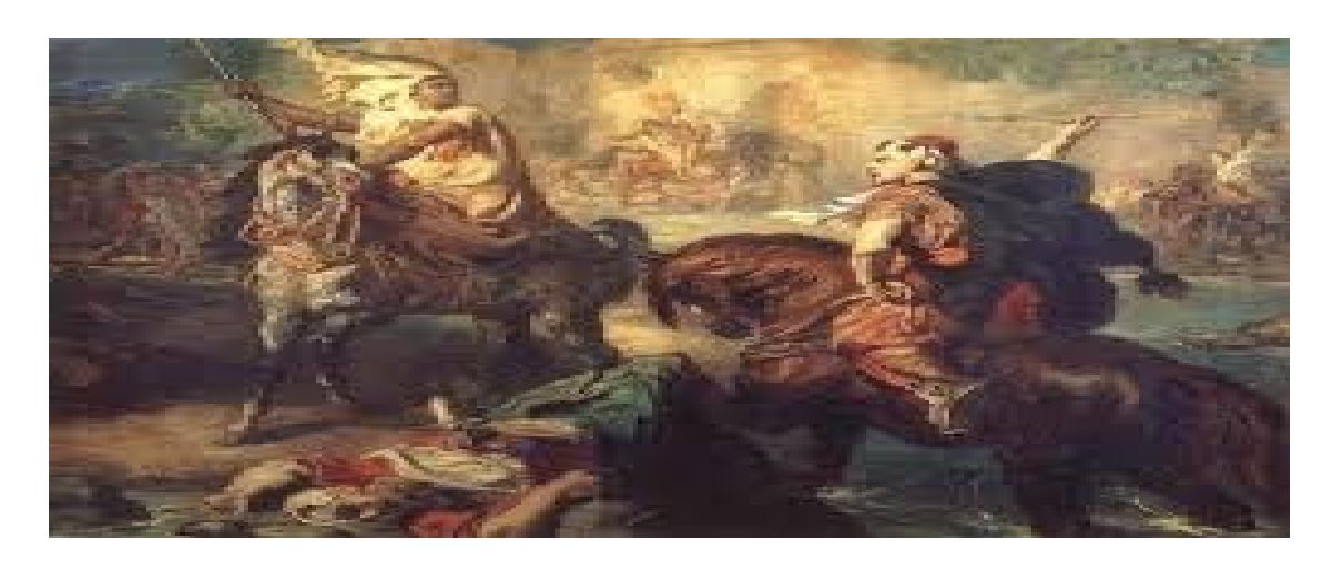
Figure 7 . Théodore Chassériau, Arab Chiefs Challenging Each Other to Single Combat under the Ramparts of a City, 1852.

While British Army during the nineteenth century used to retire its officers when they reach the age of fifty because "no Oriental was ever allowed to see a Westerner as he aged and degenerated" (Said, 1977,p.12) but they tended to present only old, poor Orient to confirm their superiority in a win-lose battle.