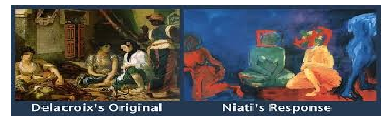
Figure 13. Algerian Women in Their Apartments by Eugene Delacroix, 1834.

Orientalists and their subjective accounts of the East and at the same time challenges their works, there is a similar movement to respond to some of these Orientalist painting by Oriental painters. As we see it in her response to Delacroix's painting of Algerian women and her response work entitled not to torture which shows these women as normal human being, focusing more on human nature than a surface representation to show that they went through many miseries and hardships during colonial era.