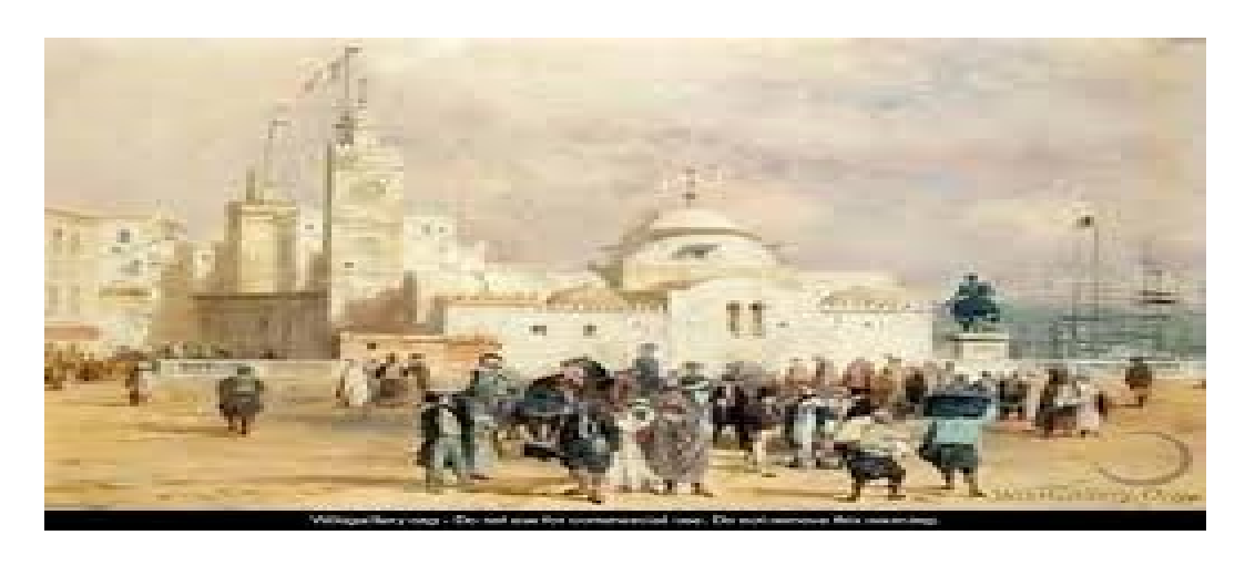
Figure 6. Adrien Dauzats, The Place du Gouvernement at Algiers, 1849.