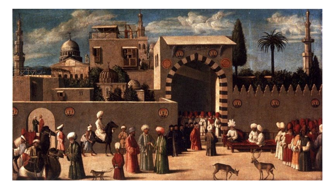
Figure 1. The Reception of Ambassadors in Damascus, 1511.

Textual Attitude entails an unknown, doubtable situation in which books or texts can provide the readers with clue or knowledge about the real lives of human beings but there is a constant danger of falling into superficial conclusions or misapprehension that are the result of biases incorporated within the texts. It occurs in two situations. The first case occurs when a person confronts a situation that is far unusual for him so he has no experience about this situation but he may read about it previously. In this situation, the book acquires a greater authority, and use, even than the actuality it describes."(Said, 1977, p. 94) This is the case with this anonymous painting which depicts the gate of Damascus but this dear with anther is never existed in Syria up to this time.