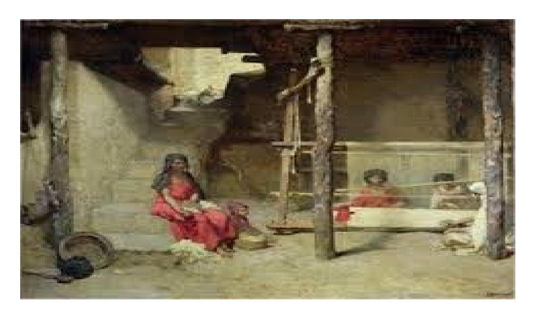
Figure 9. Gustave Guillaumet, Weaving Women at Bou-Saâda, 1885.

Therefore, Western Orientalists claim that Orient has no history, because it is stable and fixed without any change, and that Orientals are primitive and simple because they do not have any wisdom. Said uses this discourse and argues that Western cultural institutions are responsible for the creation of those 'Others'. It is their strategy to establish this binary opposition of Occident and Orient or Self and the Other to claim "the naturalness and primacy of the colonizing culture and world view "(Ashcroft et al., 2000, p. 155). Then he adds that is always depicted in need, he even has no knowledge of himself and is faced with this fact that there is always "a source of information (the Oriental) and a source of knowledge (the Orientalists)" (Said, 1977, p. 309). In an article in the book Orientalism Revisited: Art, Land, and Voyage , Zahia Smail Salhi (2012) comments about Alloula's book The Oriental Harem which is a collection of photos taken by Western photographers. Her comment can be applicable to the analysis of these paintings as she says "They turn the difference into hierarchy; it highlights the difference between "self" and "Other" in terms of hegemonic power relations."(p.258)