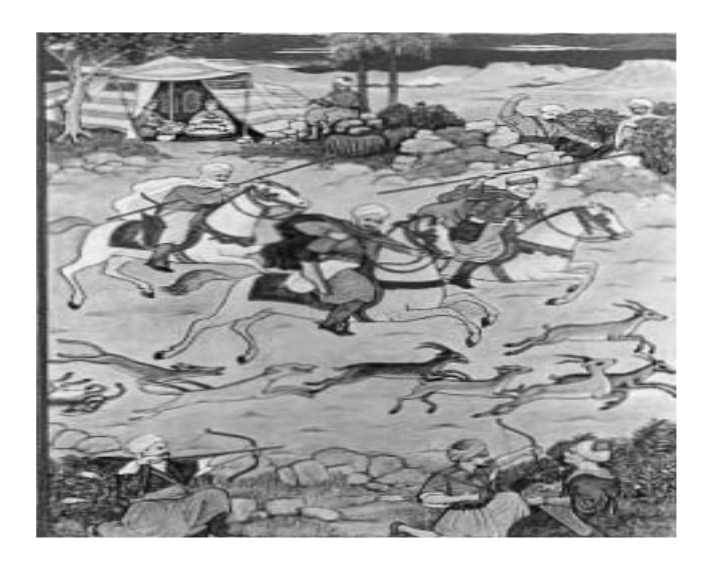
Figure 5. Persian Hunt by Mohammed Racim 1920.

works is somehow "a Maghrebian self-affirmation in the face of the colonial presence." (p.222)