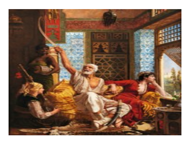
Figure 2. Women and an Old Man in Harem by Walter Charles Horsley, 1883.