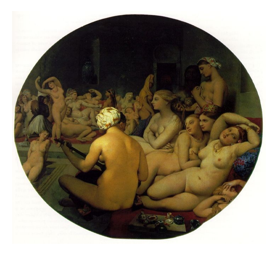
Figure 10. Turkish Bath by Jean Auguste Dominique Ingres, 1862.

Occident possesses the knowledge and Orient is in urgent need of it. His knowledge justifies what evil he does. What we see in this painting that they have no knowledge in fact as they claim. Ingres as a male was not allowed to thread in a bath full of women, he just depicted his sexual fantasies because all these women have fair skins and European complexions. This is imperfect kind of knowledge they claim as their source of power. They are so confident in depiction of Orient as if they know them better than the Orient themselves.