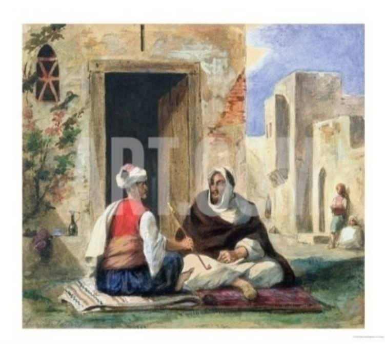
Figure 8. Eugene Delacroix, Arab Men Smoking in front of a House.