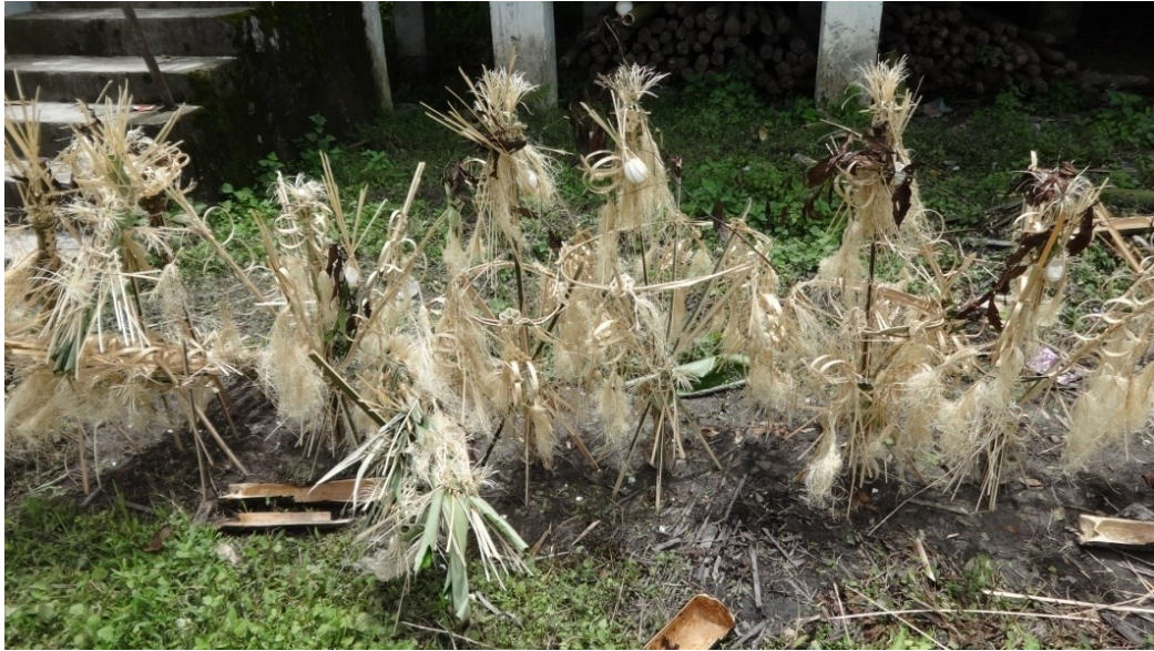
Figure 1. The idol of spirits made up of bamboo with blood and eggs as offerings