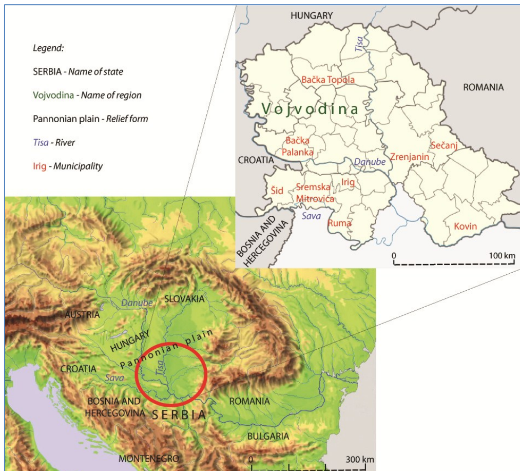
Figure 1 Geographic position of municipalities where are the settlements in which the participants live, Source: Zentai, 1996; Map 1, 2014

Survey stances were measured on a five-point Likert type scale ranging from 1 (strongly disagree) to 5 (strongly agree). The interviewing was conducted during the summer and autumn 2013. Data were analyzed by descriptive statistics and using T-test, one-factor analysis of ANOVA variance and Post-hoc Tukey HSD test. T-test was made with independent samples and compared by arithmetic mean of two groups. As it was not possible to assume the result of comparison, 2 tailed test was used. The results of T-test discovered significant statistic differences between average mean of the participants gender, political engagement and the origin of the participants according to the altitude they have settled, at the importance level p < 0.01 ( t \geq 2.57 ) (Pearson & Hartley, 1966).