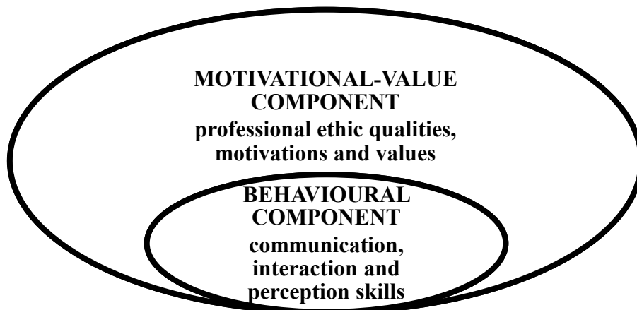
Fig.2. Hierarchy of mutually dependant elements and components of communicatione culture

Thus we view social worker communication culture as a part of communication culture that reflects the extent to which a social inspector acquired the base of knowledge in ethic norms, psychological principles and laws of communication, as well as communication skills and the way these norms and skills are relevant to personal values and motivations. The culture is demonstrated through behavioural patterns (see Fig. 2). As a result we found that communicative culture is a complex system with numerous elements and relations that form integrity. The components of the whole structure were relation-stratified.