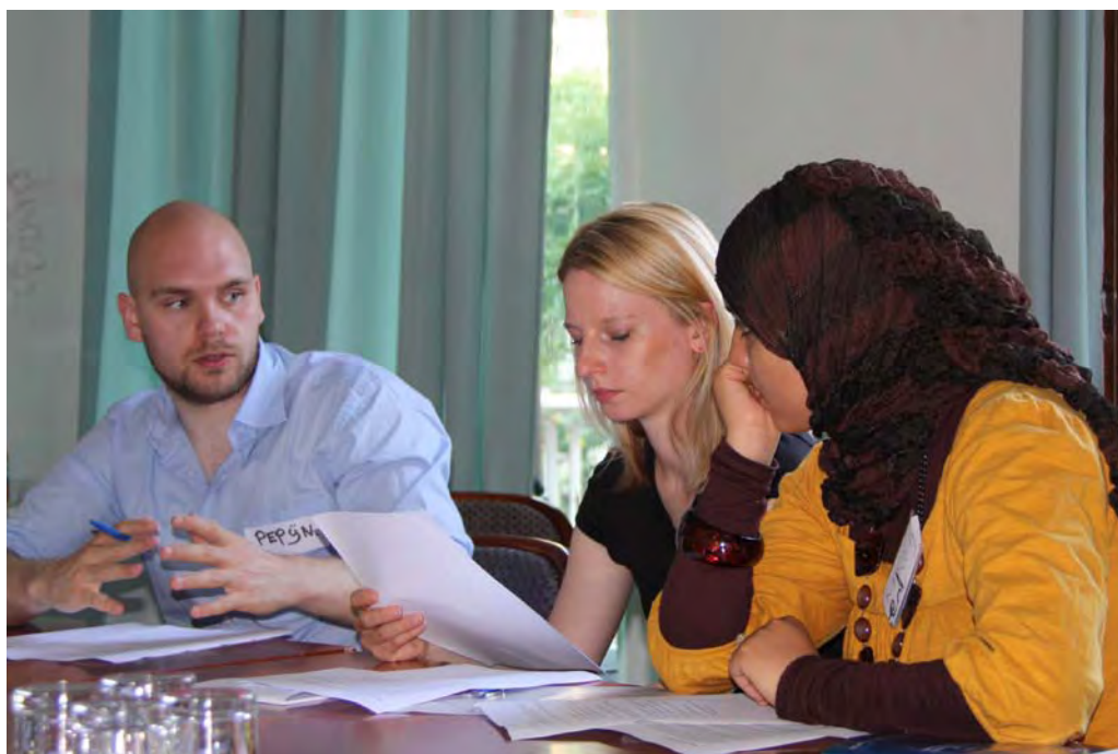
Discussions in small working groups are an important part of the Summer School