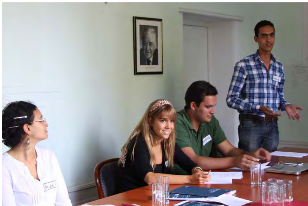
During several Working Group Sessions the participants prepared the debates

Oxford-style debates are highly regulated in terms of time limits, speaker positions and procedure. The discussants are divided into two groups: Proposition (Yes) and Opposition (No). The participants' personal opinion is not decisive, since the discussants have to defend the position they were assigned to. In case of the Summer School, each group comprised seven or eight members. In each debate, the first group spoke in favor of the motion, the second group opposed it. The audience—which had the opportunity to pose questions and comments in a Q&A-session—consisted of the two working groups not directly involved in the debate.