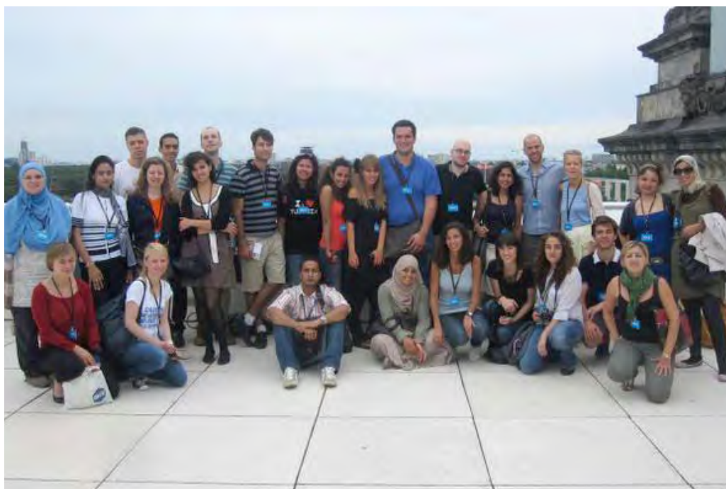
The group on the Reichstag's terrace

The weekend mainly consisted of free time. Only on Sunday, a visit to the Reichstag, the seat of the German parliament, was part of the Summer School program. During the guided tour, the students were introduced to the German political system, to the history of the building as well as various modern art projects in the Reichstag. After the tour, the participants made their way up to the famous glass dome and enjoyed the magnificent view over the city.