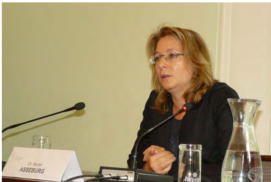
Dr. Muriel Asseburg during her talk on Syria

Asseburg predicted a steady escalation of the conflict that would spread all over the country and emphasized that the status quo can never be upheld and the Assad regime stabilized. But she only saw a glimpse of hope for the protesters and the chance of toppling the regime by defections from within the regime and high-ranking officers in the army. She pointed out that an alarming phenomena is the rising sectarian tension that could lead to more violence but also a full-fledged civil war with major regional repercussions and a probable Turkish military intervention. Asseburg ruled out a negotiated regime change as too much blood has