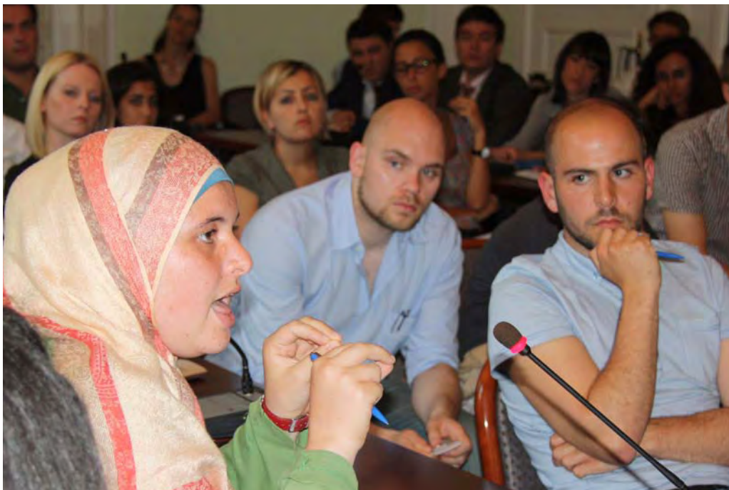
Heba from Egypt is posing a question during the panel debate