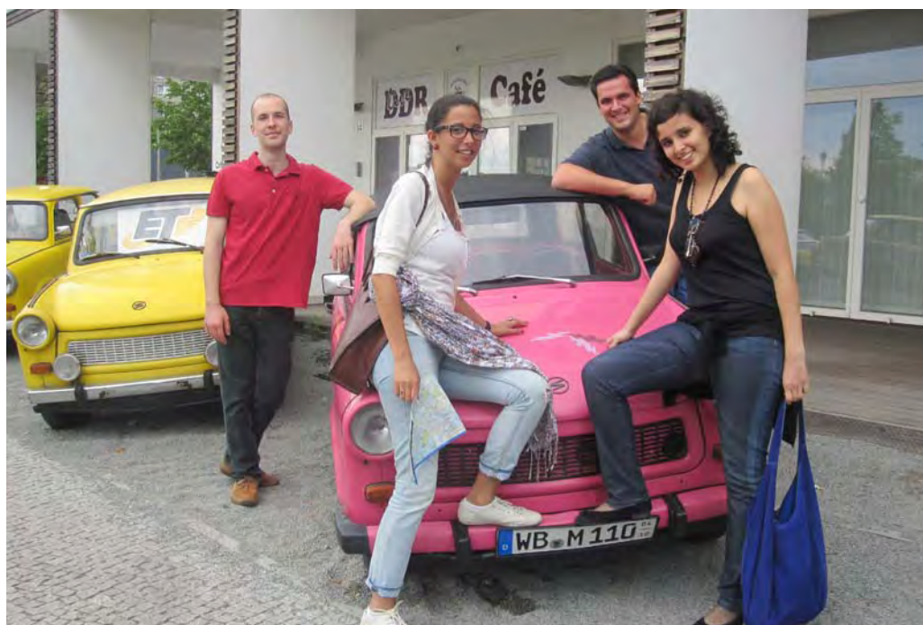
One group is posing with the famous East-German car "Trabant" during the Scavenger Hunt

On the first day of the program, following the official opening and the first lecture, the participants embarked on a scavenger hunt through Berlin. In four teams they made their way through four different neighborhoods and explored the city's history, culture, and its people. Afterwards, the evening was rounded off with a dinner on DGAP's terrace where the participants had the chance to share their experiences and to get to know each other in a relaxed atmosphere..