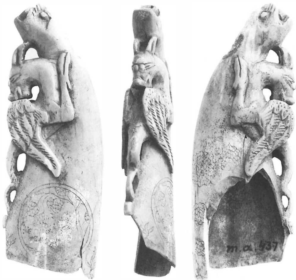
Medieval ointment horn, carved and engraved from a sperm whale tooth. Bergen Museum, University of Bergen, Norway, Collections of Christian Art and Culture, Inv. MA 437. Left: View of the right hand side. – Middle: View of the posterior side. Right: View of the left hand side.