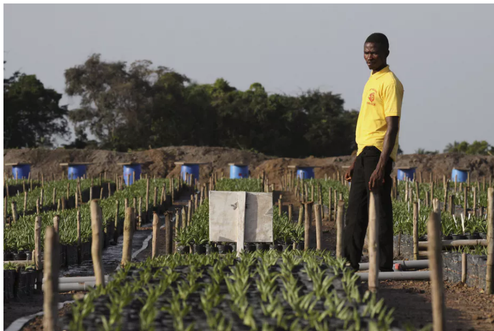
A man stands by seedlings at the Sierra Leone plantation of Lichtenstein-based firm, Socfin.