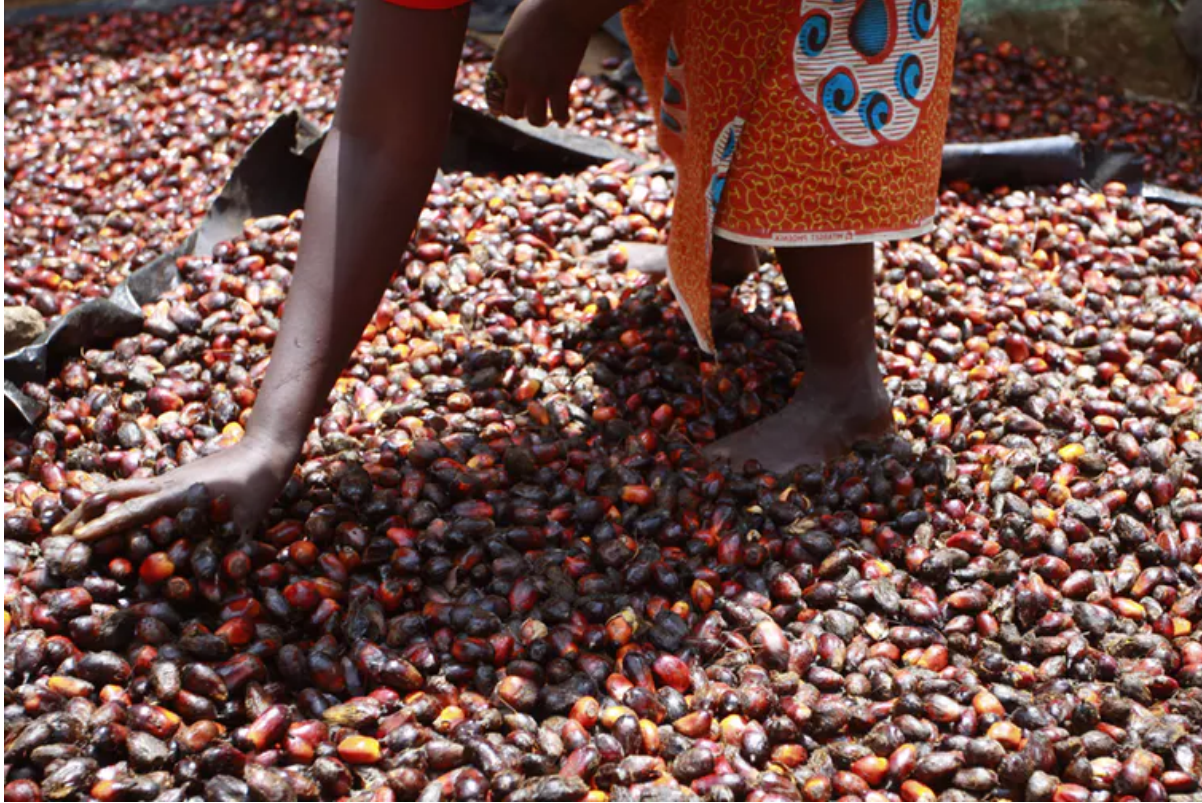
Palm oil production in Côte d'Ivoire.

Most of these deals cultivate pure food crops, and crops that have multiple uses, such as oil seeds. Palm oil is the single most important crop driving large-scale land acquisitions.