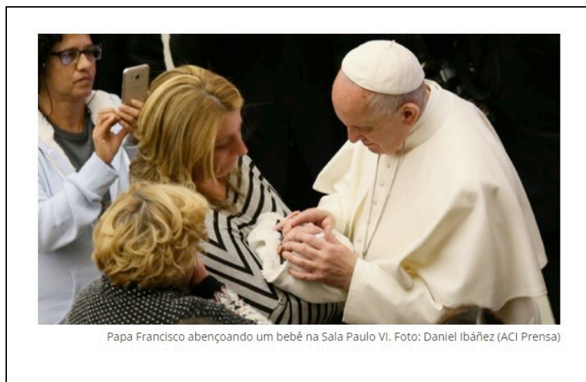
Figure 1. Pope welcomes single mother with her son