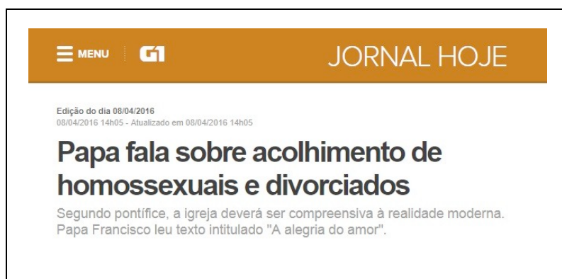
Figure 4. Article from Jornal Hoje website - Rede Globo - Brazil

This bundle of relationships is evident in the images circulating on the Pope's profile on Instagram and Facebook. Rosa (2015) speaks of images as a symbol of an event. In this case, we observe Pope Francis' gestures transformed into an event from its inscription in several media, representing its value in circulation. In most cases, the sentences or situations are pinched and passed on, valued by both social actors and journalistic institutions. Thus Rosa (2015) points out that when an image becomes a symbol of an event, 'bigger is its value of circulation on devices of media institutions and on media devices of individual actors is increased, enlarging its power of transcendence' (Rosa, 2015, p. 139).