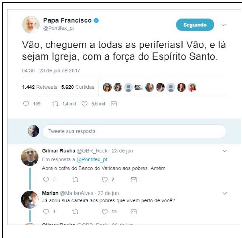
Figure 3. Pope Francisco on Twitter