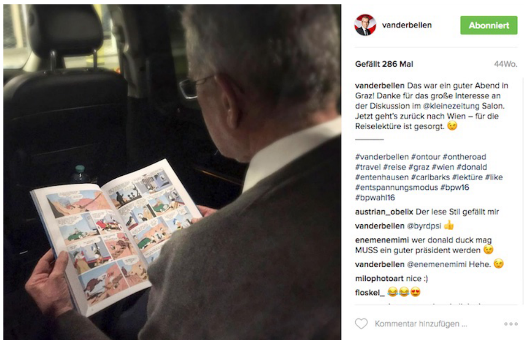
Figure 4. Reading a Donald Duck comic book, posted on 11 April 2016.

2016), watched a game on a television screen before an interview (in May 2016), or posed for photos with soccer fans in July 2016 and in October 2016.