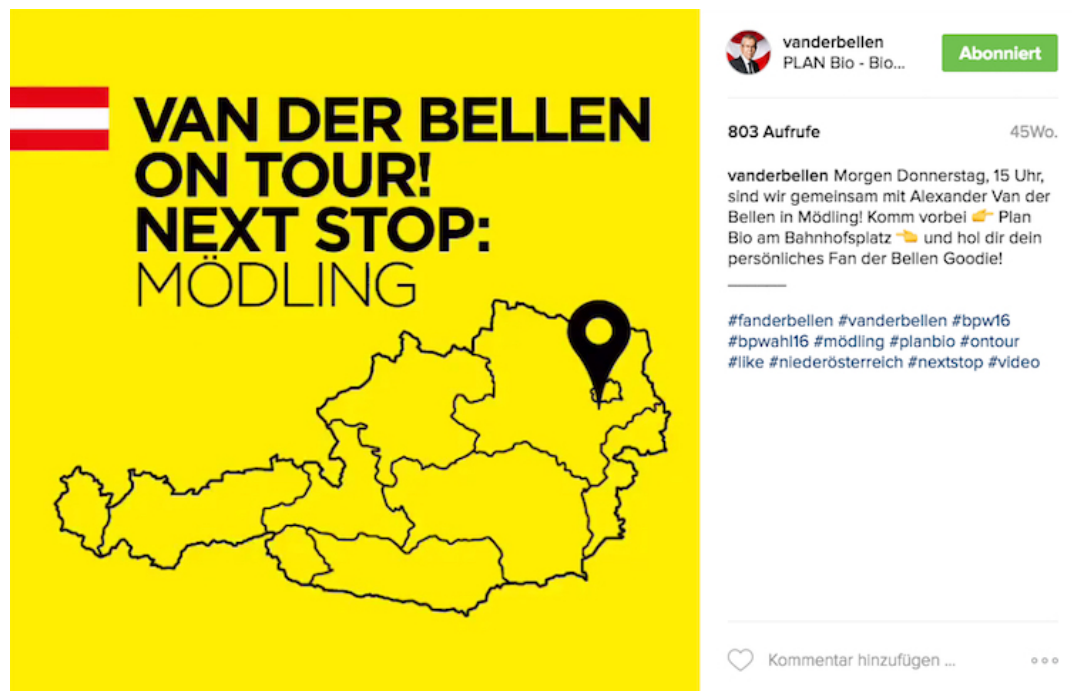
Figure 1. Van der Bellen on tour, posted on 6 April 2016.

The image type media work (n = 79) comprises visual imagery that shows the candidate during interviews or press conferences, or at events organized by media representatives (e.g., panel discussions). Among these