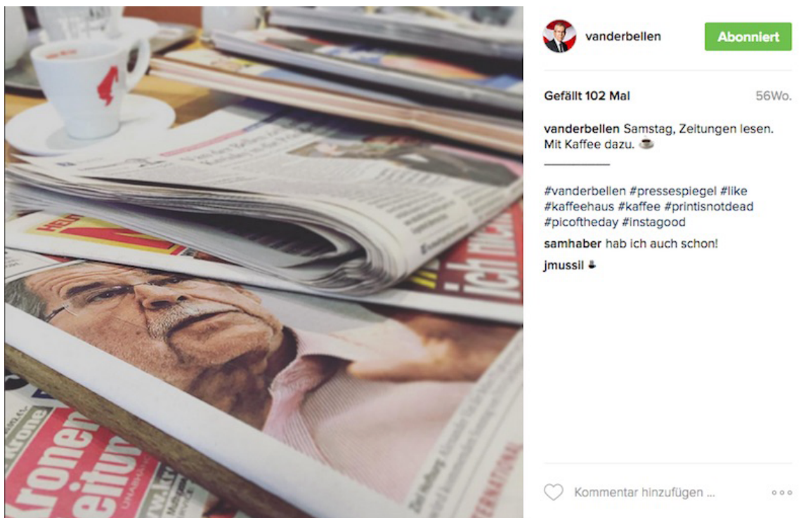
Figure 5. Coffee and Newspapers, posted on 9 January 2016.

or welcome ceremony, or shaking hands), discussion (n = 18; Van der Bellen was frequently presented in debates with young voters) and endorsement (n = 17; which showed mostly prominent supporters, e.g. in March, April and May 2016) underscore the political importance of the candidate.