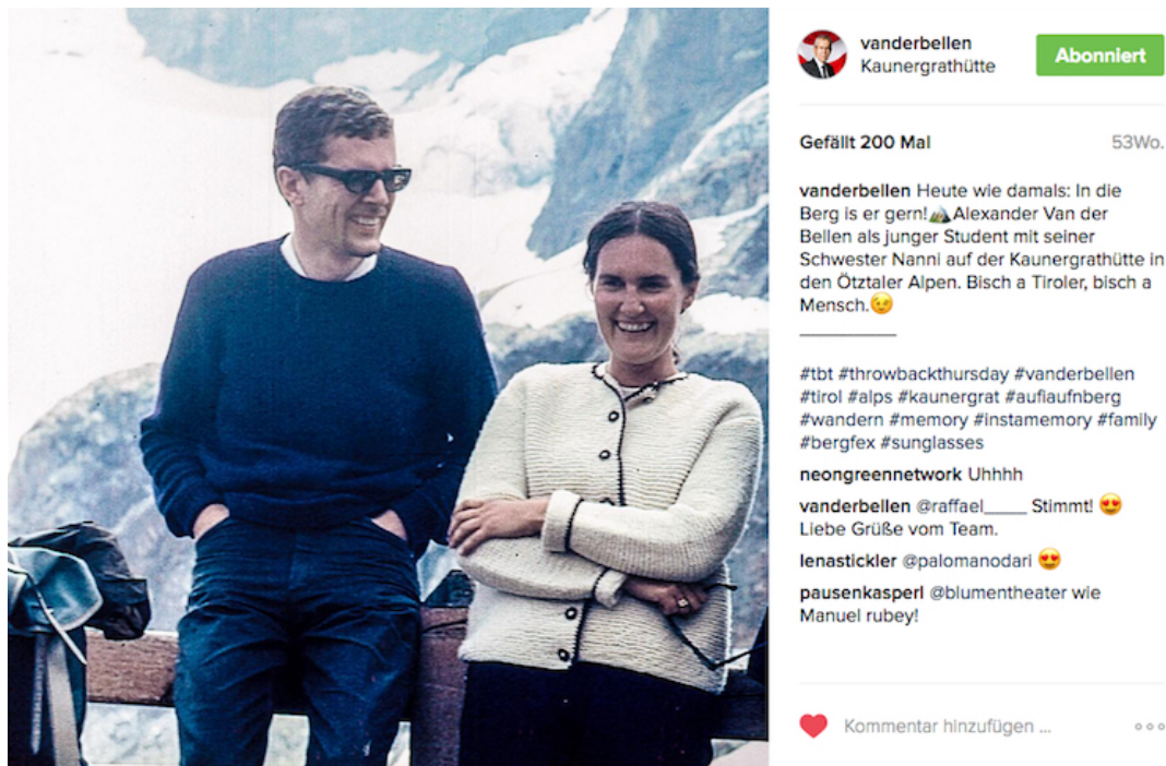
Figure 3. Throwback photo of Alexander Van der Bellen, posted on 4 February 2016.