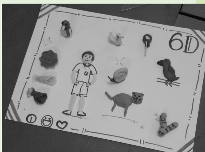
Figure 2: Hospitalized client is placed in a cabin that offers the possibility to view the factors inherent in his life outside hospital.

Nursing student 8 had Figure 2: set up a booth in 6D interactive so that the person admitted for a long time to check on your plants in the garden or pots and or your pet.