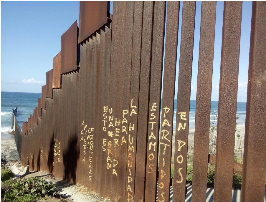
Border on the Mexican side, Tijuana, Baja California Norte, Mexico