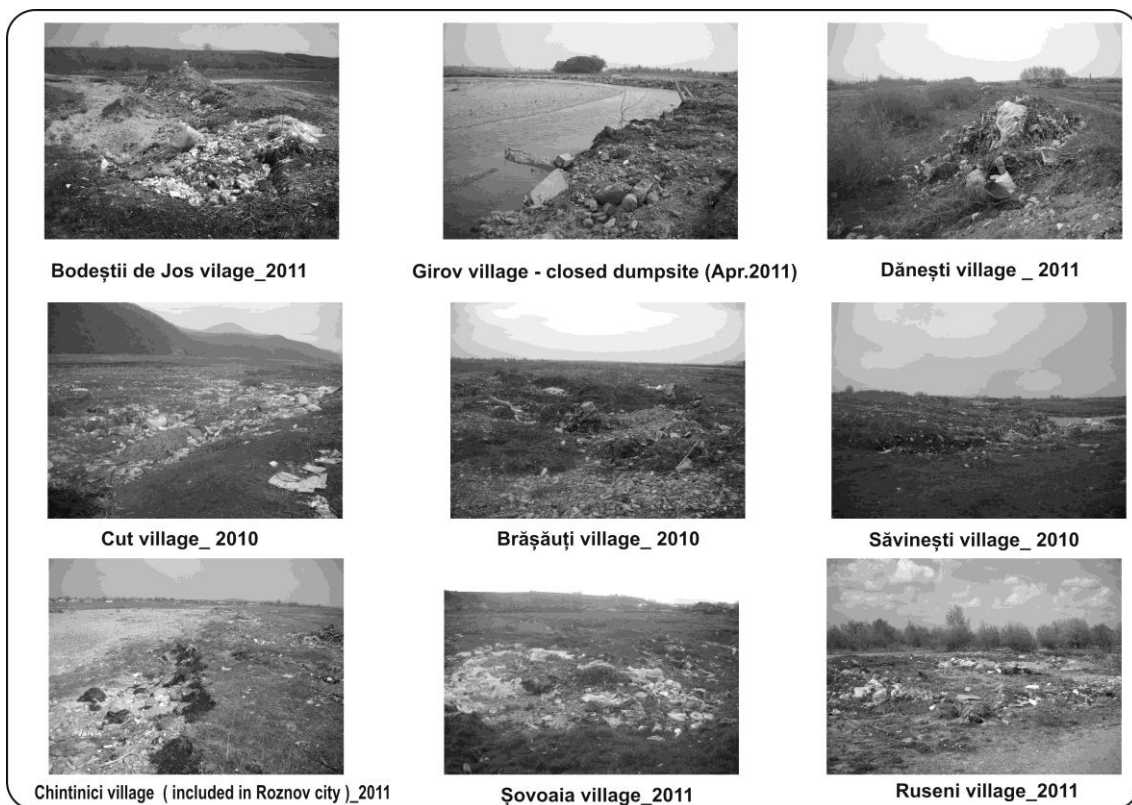
Fig. Rural dumpsites on Bistrița and Cracău floodplains from subcarpathian sector