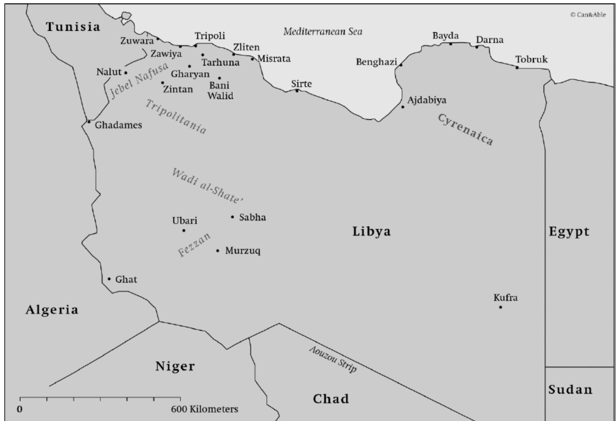
Map 3: Libya

Veterans of the Afghanistan war also founded the Libyan Islamic Fighting Group (LIFG, al-Jama'a al-Islamiya al-Muqatila bi-Libiya), which organised in secret for a number of years before announcing its existence in 1995. 3 Reflecting the international experiences of its leaders, the LIFG saw itself not only as the spearhead of jihad against the tyrannical Gaddafi regime, but also as an integral component of a global jihadist movement. Between July 1995 and July 1998, LIFG cells clashed frequently with Libyan security forces. Three attempts to assassinate Gaddafi failed, one of them only narrowly. 4