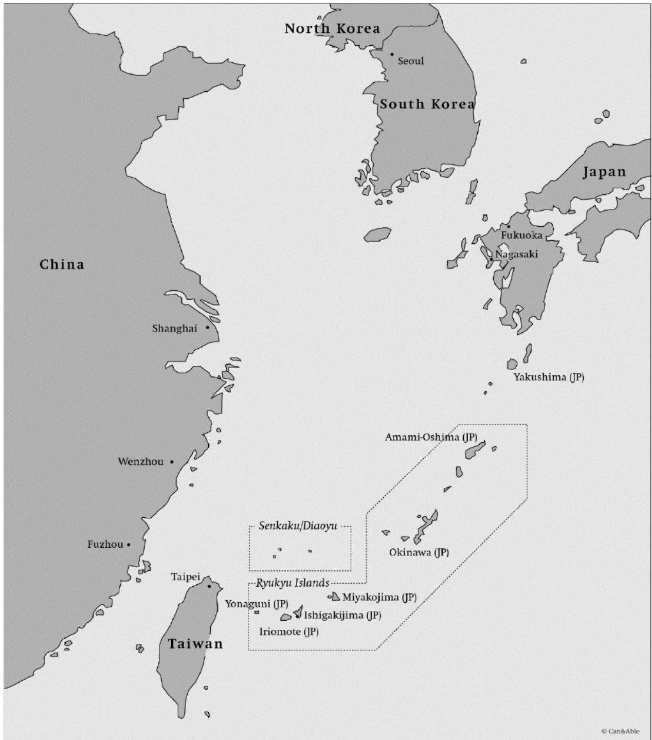
Map Senkaku/Diaoyu Islands in regional context