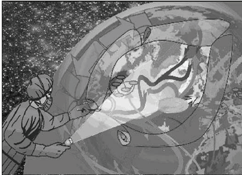
Figure 2: Earth System Analysis and the Copernican Revolution

ton diagram (see Fig. 1) and soon GAIM was “redirected to address the system as a whole” (Moore 2000, 2). One part of GAIM’s new goal was to produce concepts usable in global environmental management. Writing as the new chair of GAIM, systems analyst Hans Joachim Schellnhuber proposed Earth Systems Analysis as a way “to yield a unified formalism for describing the make-up and functioning of the ecosphere machinery” (Schellnhuber 2000, 3).