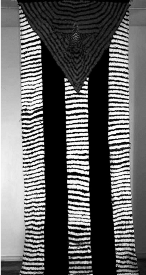
Abb. 11: Tania Bruguera: Estadística (Statistics) , 1996–1998; Installation; Human hair of anonymous Cubans, thread/fabric 11.80' x 5.57', Courtesy of Studio Bruguera, © Tania Bruguera

Tania Bruguera is another performance artist who has been at this forefront. Bruguera exhibited at the Global Feminisms at the Brooklyn Museum of Art (2007), where she exhibited Estadística (part of her Memoria de la posguerra series). Estadística was fabricated from human hair collected from residents of Cuba. During a five-month collaborative project, Bruguera worked with artists and citizens from all over the island who contributed their hair and assisted in the rolling or sewing of the work. After being rolled into cloth strips, the hair was then attached to the work's support structure. The textile is suggestive of the Cuban flag in its design and recalls the mourning flags flown outside homes on the island. Its technique of fabrication recalls the role of women during the Cuban war of independence (1868–78), when they sewed what was at the time a flag of liberation ( Global Feminisms 2007).