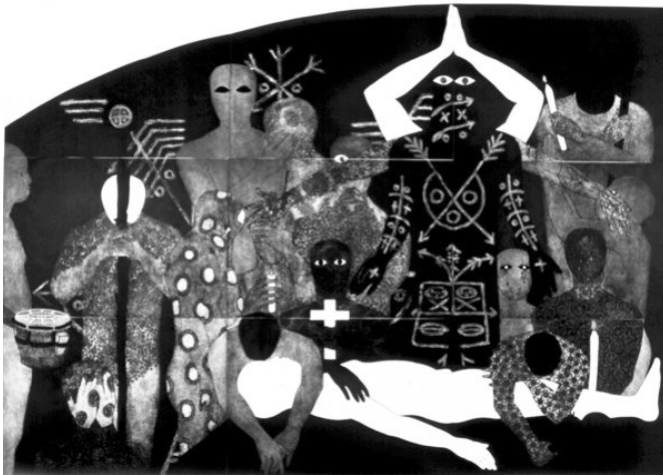
Abb. 6: Belkis Ayón: Nlloro , 1991, collography, © Courtesy Estate Belkis Ayón, Photographs José A. Figueroa

Ayón was interested in relating the myths and rituals of the Abakuá to larger themes and issues, where she emphasized her role in uncovering the mysteries of this closely guarded secret male society. The principle feature of this artist's work is her depiction of the symbols and rites of the secret society. A recurring character in her work was Sikán, a woman who discovered the secrets of Abakuá and was sacrificed by the men in the society in order to prevent the dissemination of the sect's secrets. 4 In Ayón's prints, the sacrificed victim becomes an active participant, and one cannot help but see the artist in the figure of Sikán; Through her suicide, she is metaphorically a martyred Sikán.