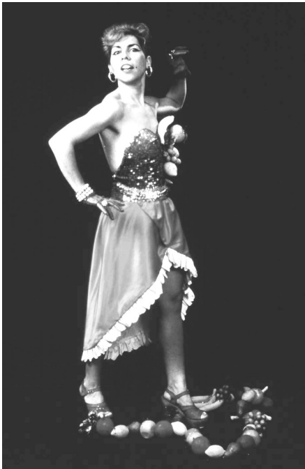
Abb. 10: Carmelita Tropicana: Candela , 1988 ( http://carmelitatropicana.com )

“I confess, in the beginning I shunned the word feminism. For years I was in the dark, blinded by a chiarascuro , lost. Until 1982 when I stepped into the WOW Café [in the Lower East Side] (Women’s One World) the door flung open and there was light. I stepped into the spotlight and became a thespian feminist. Finally I could see feminism was full of choices: you could be a fashionista or not, shave or be naturally hirsute. It was abundant, colorful and for women of color, fun, funny, sexually transgressive. I suffered an ecstasy greater than that of St. Teresa in the statue by Bernini. I had found my tribe – the feminists; I’d found my calling: Kunst is my waffen – art is my weapon. As an enlightened being I began to make mama and dada art dedicating myself to Kunst .” (Troyano, Elizabeth A. Sackler Center for Feminist Art Feminist Art Base)