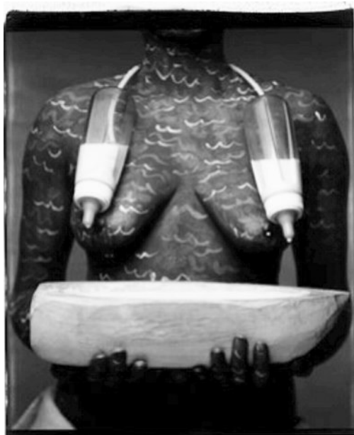
Abb. 5: María Magdalena Campos-Pons: When I Am Not Here/Estoy Allá , 1996 (Freiman/Enwezor 2007)