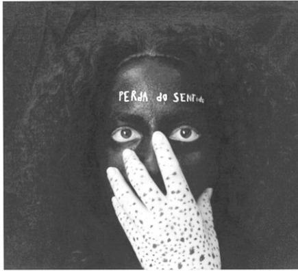
Abb. 9: Elsa Mora: Perdida do Sentido Series , 1999–2001, © Elsa Mora