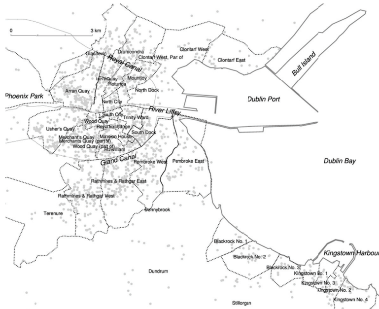
Figure 1: Locations of Selected Occupations in Dublin City and Hinterland

by pure market factors – do people live wherever housing in their budget is found? Or do culture, life style and taste – status considerations – have a role to play? How do accountants compare with the other occupations?