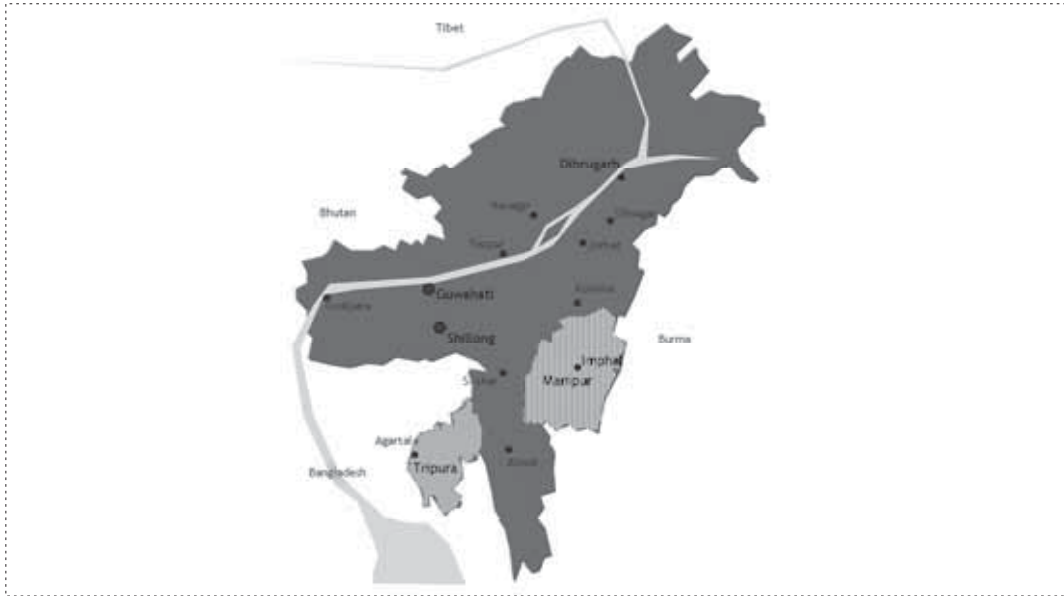
Figure 1: Assam at the time of independence showing the then neighbouring states of Tripura and Manipur