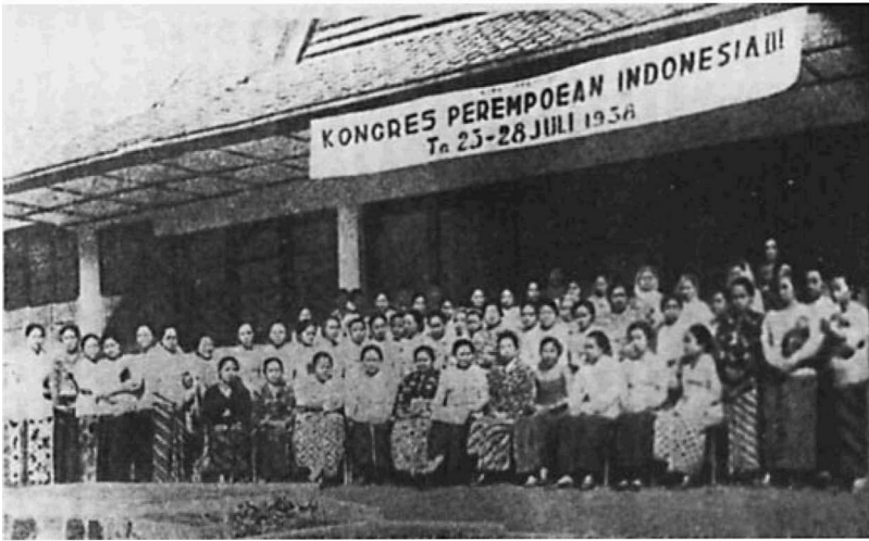
Kongres Perempoean Indonesia, July 23-28, 1938.

Dutch colonialism and some twenty years of Indonesian independence before Indonesian women saw their priorities reversed by the new marriage law of 1974.