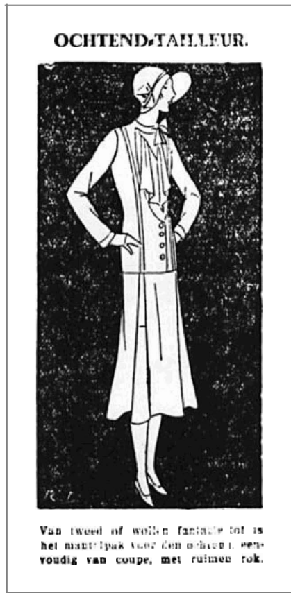
A woolencoat and skirt , Java-Bode . July n, 1930.

Fashion reports in the women's pages of the daily newspapers were selections of what was considered to be of interest to women in the colony. The reports embodied the characteristics of fashion so aptly described by Barthes in the 1950S; timeless, placeless fashion pages represented female readers and their dreams: women without sorrows or problems, beaming and beautiful, banishing 'anything aesthetically or morally displeasing':