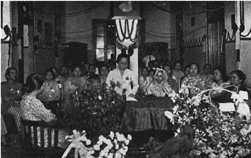
Indonesian Women's Congress of 1930 December 1930, where the PPI changed its name in PPII, Perikatan Perhimpunan Isteri Indonesia or Federation of Indonesian Wives Organisations.