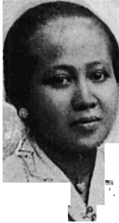
Raden Ajeng Kartini in 1902 (KIT, Amsterdam).

result of the voluntary monogamy debate of 1937 (see chapter 5 of this volume), the Islamic parties had founded a federation in the MIAI ( Majelis Islam A'laa Indonesia ) as well. 30