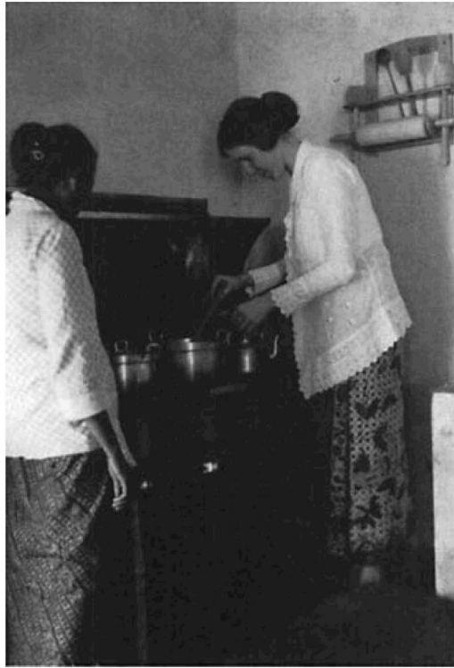
European woman behind a modern gas stove, still wearing sarong and kebaya , ca. 1925.

peas. Poorer Europeans as well as the indigenous population ate meals of rice three times a day. 72