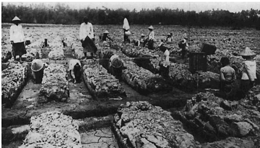
Planting sugar cane for the sugar factory Ketanen in 1916

on twenty estates were recorded daily for thirty days. In the survey, three tea, three coffee, six rubber, two tobacco and four sugar estates were involved as well as two forest ranges and for comparison, the same details were collected from 390 tani (peasant) families in the surrounding area. As no women were employed in the forest ranges, I shall not discuss the latter. The working-class families were categorised first according to their involvement with the estate - whether they were living on or off the premises - and then according to their jobs. Thus there were families of garden labourers, factory workers, and top labourers ( mandur and tukang ). 54