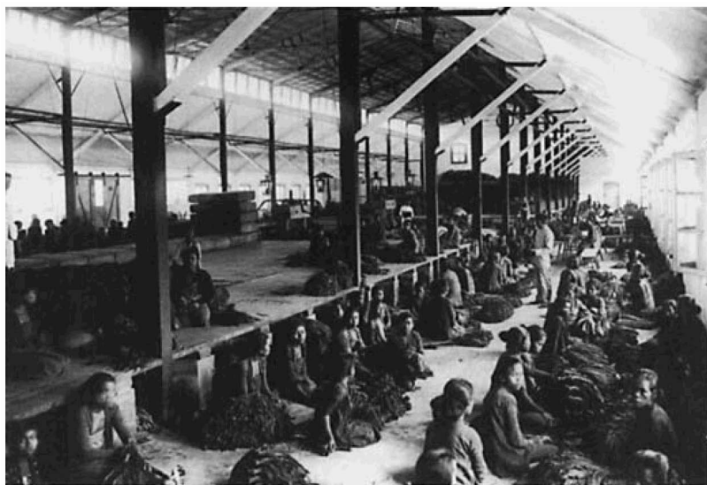
Sorting tobacco leaves on the Gajamprit estate, Surakarta, no year (KITLV, Leiden),

The report also showed how important female labour was for the estates surveyed. In 1933, the Labour Office ( Kantoor van Arbeid ) had already reported that there was as many male as female labour on estates in Java, particularly on the tea estates in West Java, the tobacco estates in Central Java, the coffee estates in East Java and the sugar estates in Central and East Java. The figures of the 1930 census pointed in the same direction. According to these - and quite apart from casual coolies - women represented 25 percent of the labour force on the sugar estates and 45 percent of labourers on the other estates. The