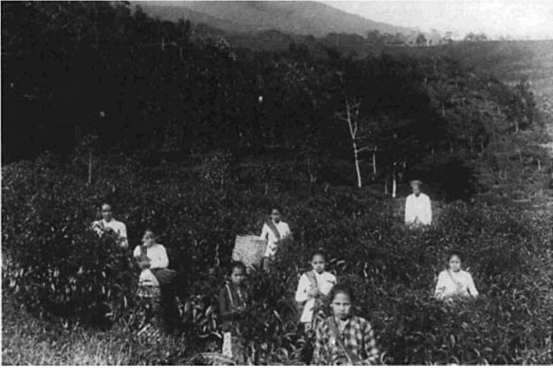
Harvesting tea at the Selokaton estate, Kendal, no year.

Coolie Budget Survey confirmed these figures except for the tobacco and sugar estates. In this respect, it turned out that the estates in the survey were not representative. However, of all labourers between ages 16 and 61, 40 percent were women, who mostly came from families of garden and factory workers. In these categories, estates made use of both male and female labour, and women took the opportunity to work. However, their labour hours were less than that of the men: of all hours spent in gardens and factories by men and women, women did not account for 40 percent, but for slightly more than a quarter, 27 percent and 29 percent respectively. Women in top positions of any significance were found only on the coffee estates, where women accounted for 20 percent of all hours spent at that level.