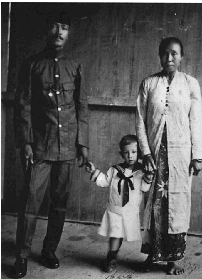
Dutch boy with babu and male servant (the driver?), ea. 1910 (KIT, Amsterdam).

trial organisations in japan.?? In the case of modern Indonesia, we may conclude that - even if the Suharto political rhetoric of the family did not have its roots in colonial 'familisation' - it was strongly reinforced by the language and ideology of Western colonialism.