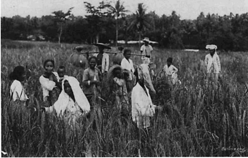
Cutting and transporting rice, no year (Private).

men, women, and children, as well as the remuneration, selling prices, and profits were recorded." These analyses offer documented proof in figures of the important role of women in sawah or wet-rice cultivation on flooded fields, as the Europeans had already observed in the nineteenth century." The situation in dry-rice cultivation was similar. On average, 50 to 80 percent of the time spent on the production of rice per hectare was by women (see Appendix I). After all women had the most labour-intensive jobs: planting, weeding and the gathering of the rice ears one by one.