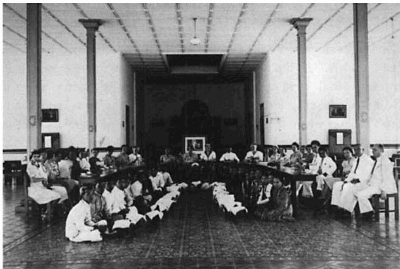
I n the Regent's pendopo, Magelang. Ceremony to decorate servants with 'medals of loyalty' for their long years of service, ca. 1985

standard wages in the 1930s for their members, but did not publish them. Days off were not common for indigenous personnel; just before the Second World War such days off were officially recommended for European personnel but not for Indonesians. f