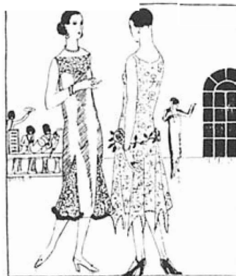
VOOR DEN AVOND.