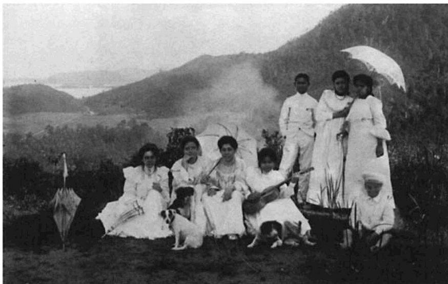
A group of Indo-Europeans, women in bébé -dresses at an outing, 1910 (KITLV, Leiden)

was completely 'out', 35 Even as early as around 1900 their popularity was not uncontested, as they had to compete with simple, straight, and plain, so-called 'reform clothing' and bébé dresses: wide, white, shapeless, and long-sleeved, with frills and ruches. The bébé dresses had a short life. In the 1910s, women of the higher classes frowned upon this frumpy 'provincial' outfit. t By the 1920s, bébé dresses were considered 'uglier than decently embroidered night-gowns, which immediately got wrinkled and were difficult to iron'. 37