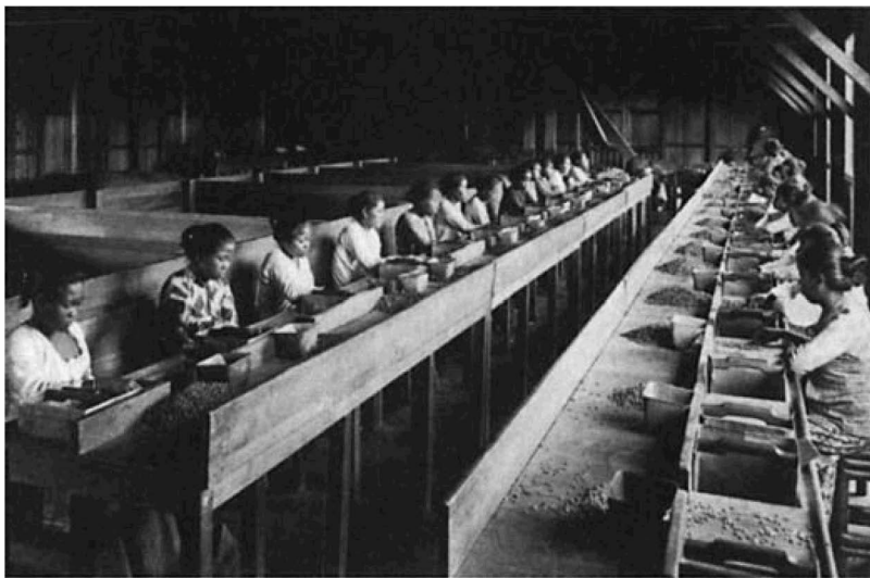
Sorting coffee beans, no year (KITLV, Leiden).

women (i.e., between 16 and 61) worked, and in the category mandur and tukang 1.5 percent. Only one out of three factories made use of female labour in harvest-time. Family labour on sugar estates, advanced in 1925 as an argument in the People's Council by representatives of the sugar industry, is hardly apparent from the survey.