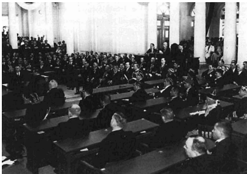
The People's Council in 1939.

changes of modernity in colonial society: educated women of all population groups had become more visible in their associations, welfare work and professional labour. The movement for women's suffrage was now more broadly based. Strong pressure from those female vc members, who were involved in the Association for Women's Rights, had begun to bear fruit: in 1936 the Patriotic Club (vc) had included the issue in its agenda. 51