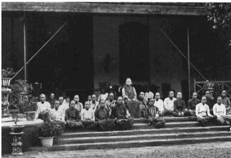
Wife of the Regent of Kudus among her servants, 1860-1870.

Dutch colonialists, placing themselves above the Javanese aristocracy, accommodated to the social patterns of Javanese society. Eurasian women, married to and heading the households of Dutch immigrants, had played a major role in these processes of acculturation since the seventeenth century, "Dutch men had accepted this pattern of domestic service all the more easily, because the climate as well as colonial prestige in their opinion demanded a leisurely pace of life. Relations between Eurasian men/women and their Javanese servants might still remain warm and familiar, especially those between women, the nyonya and her babu , as seen in Dutch colonial fiction from the Indies." In the twentieth century a different attitude was prescribed by and for totok and a growing number of Indies women, as we will see below.