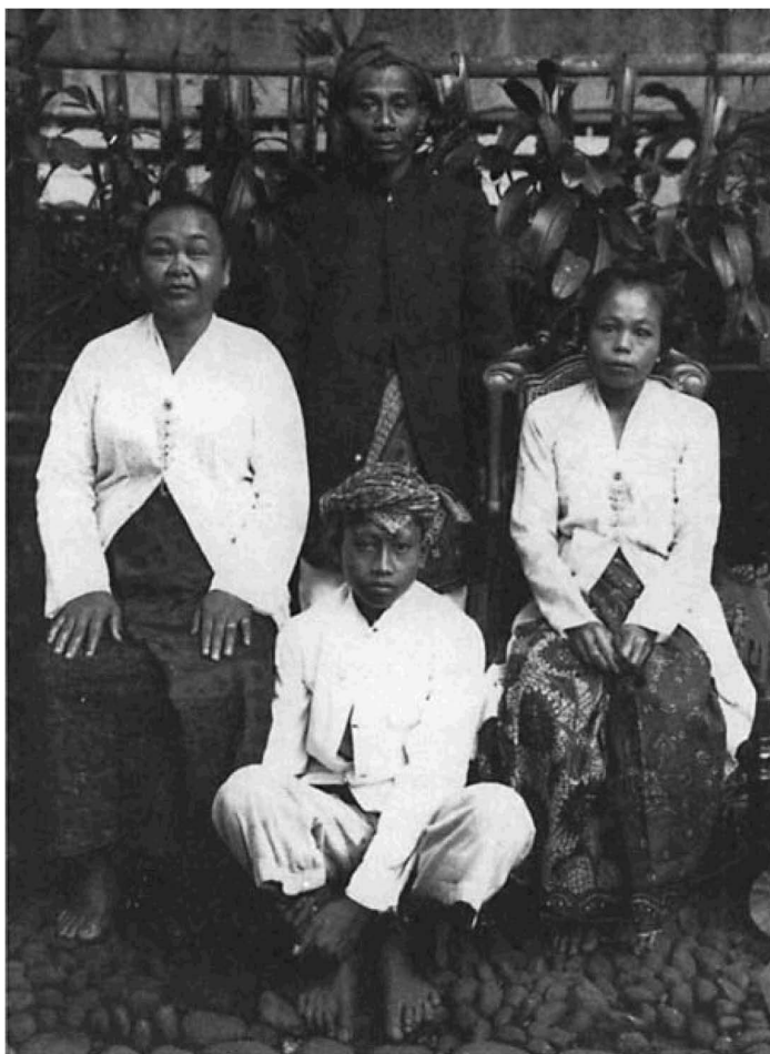
Jongos, babu, kokki, and kebon, Bogor, West Java, 1905 (KIT, Amsterdam).

and washing, as well as a coachman and/or a driver."? Another manual recommended ten." Between four and six servants was the generally accepted number among Dutch colonialists in the twentieth century. Rich people could have more, poorer ones might have less, even only one servant. In the cities, where tap water, gas, and electricity were gradually introduced after 1900, the number of servants would decline. New city planning and construction involved smaller houses with modern sanitation, providing less room for servants who traditionally lived in the backquarters of their employer's house, often with their families around. In this new situation servants might come in