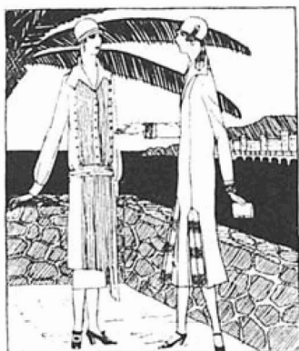
VOOR DE MORGEN WANDELING.