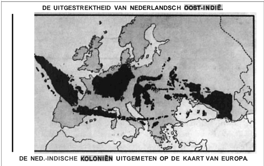
Postcard from the 1930s The Netherlands Indies on the map of Europe .

model in mind. The growth of exports - tropical agricultural products, oil and rubber - which lasted more or less uninterruptedly until the world economic crisis of the 1930s, slowly stimulated development in that direction. In the 1920s and 1930s, the Ethical Policy lost its progressive nature and turned into mere conservatism, aimed at maintaining ' rust en orde ', tranquillity and order."