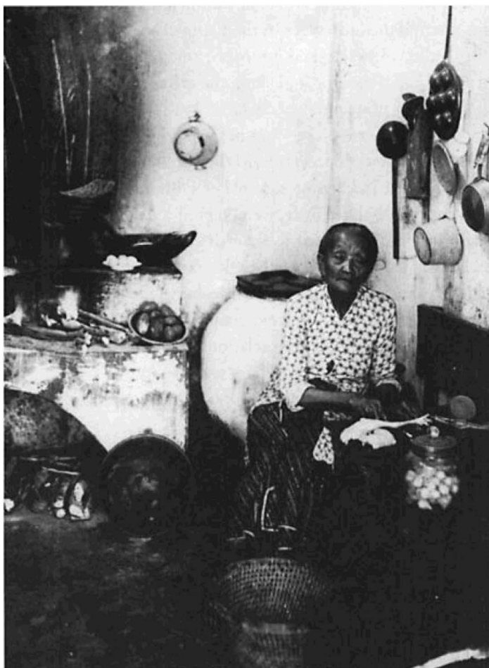
Kokki in her kitchen, no year ( KITLV , Leiden),

Next to their tasks of educating responsible citizens and maintaining colonial prestige within their households, it was this larger framework of social mothering that incorporated white women into the realm of colonial domination. It enlisted them in the Ethical colonial project and diminished the boundaries between the home and (colonial/Indonesian) society at large. To European women servants were the primary representatives of this society. The Colonial School's official ideology suggested that the task of white women was broader and nobler than being enclosed in the house. It might even convert the housewife's role into an attractive occupation, providing her with an honourable social purpose to live for. In this discourse we find again a familial rhetoric, in