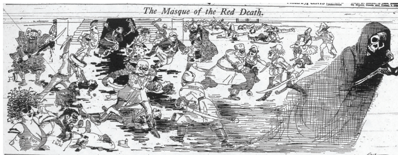
Figure 1: The Masque of the Red Death. STRIFE AND TURMOIL ALL OVER THE WORLD

With Militancy Menacing London, Mexico and Ireland Occupy the Center of the Stage of War and Warlike Preparations – Uprising in India is Feared, Albania and Nicaragua Sore Spots.