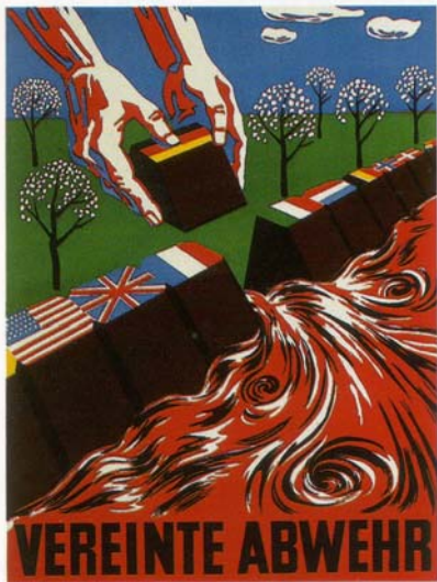
B7 Westdeutsches Plakat von 1952

Such occidentalist representation mirrors what we have called earlier the lasting imprint of cold war visions of Eastern Europe and, which, in a way, pre-announces a hegemonic western European agenda on defining it. Illustration 2 17 is a political poster of 1952 calling for the creation