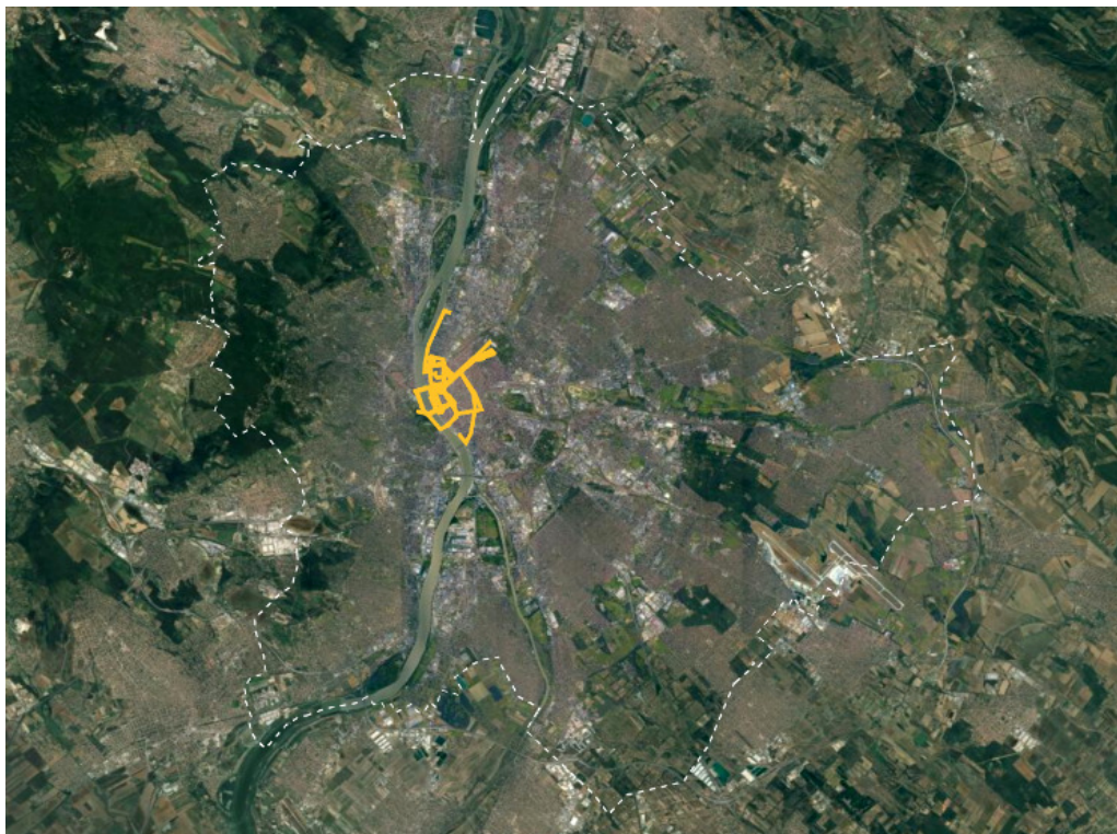
Figure 2. Routes of Pride marches in Budapest between 1997–2022.

After the democratic transformation of 1989, the Hungarian local government system became highly decentralized, leading to significant fragmentation. Budapest has a two-tier system of local government: the Municipality of Budapest and its 23 districts' local governments (Hungarian Parliament, 1990). However, the Municipality of Budapest does not represent a higher level above the districts; it possesses its own territory within Budapest, and it also "performs all tasks related to area and settlement development, as well as area planning, settlement planning, and settlement operation that affect the entire capital city or are connected to the capital city's special role in the country" (Hungarian Parliament, 2011a, para. 23 (1)). Therefore, the broad autonomy granted to the local governments of the 23 districts provides flexibility for each of them to devise distinct responses to the evolving socio-political landscape (Egedy et al., 2016; Tosics, 2006). Although the re-centralization process significantly altered various aspects of local governance, the autonomy of municipalities in addressing social issues has remained unchanged as long as their actions align with their financial capabilities (Csizmady et al., 2022).