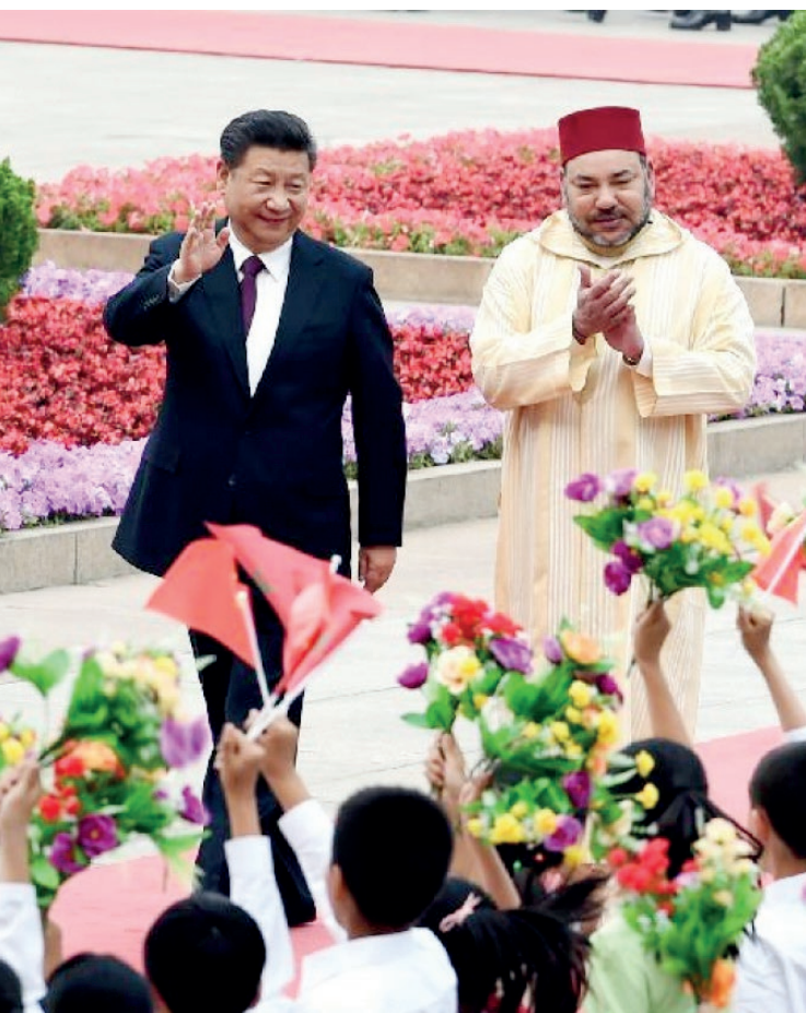
President Xi Jinping (L) holds a welcoming ceremony for King Mohammed VI of Morocco, Beijing, May 11, 2016.

Morocco was the first Arab country that implemented a visa-free policy for Chinese tourists. 1 In May 2016, King Mohammed VI visited China following this success and the country has since become a primary destination for Chinese citizens to travel to (Wang, 2017: 67).