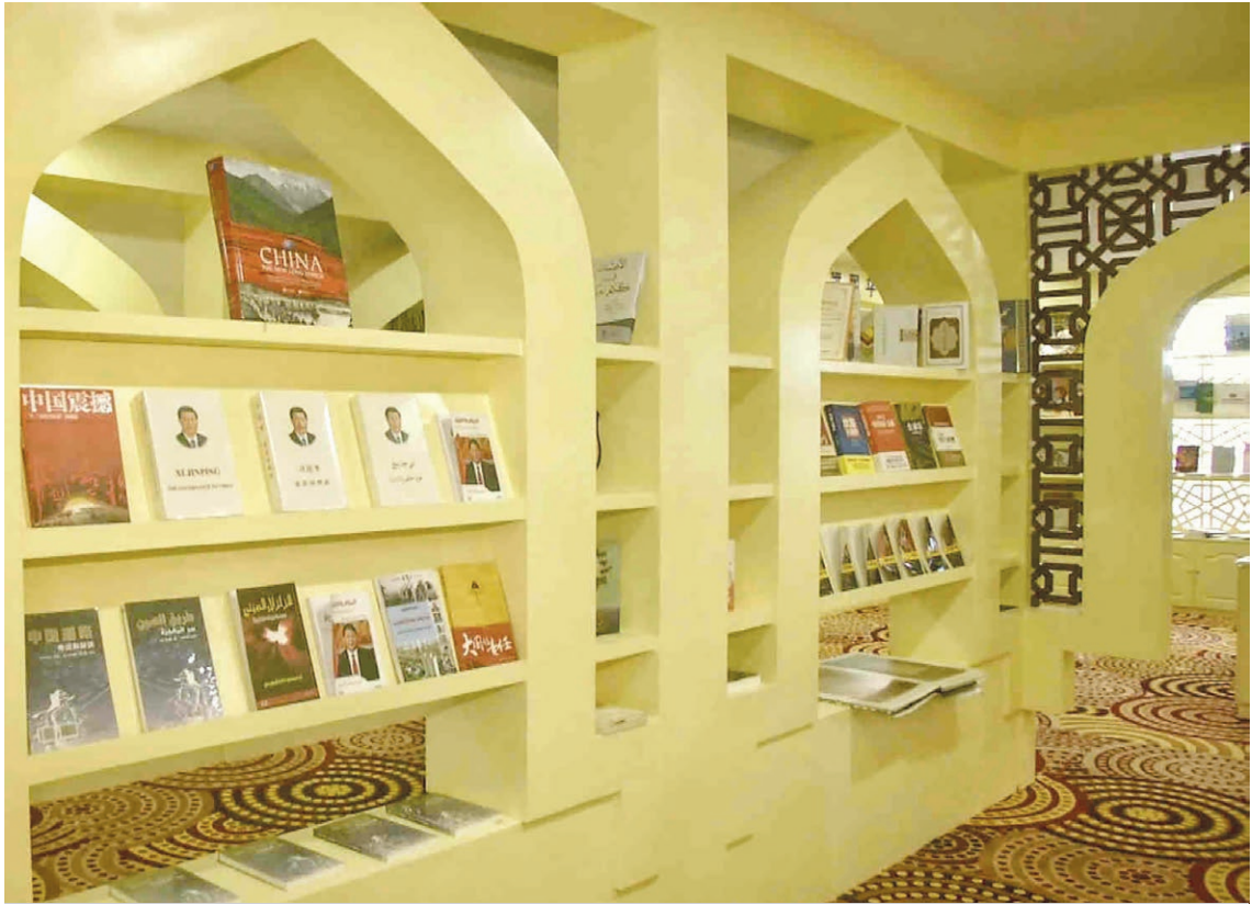
Hundreds of Chinese classic and modern books have been translated into Arabic and exported to Arab countries. (CGTN, 2017)

China invited Arab artists to participate in the “Silk Road International Art Festival”, the “Maritime Silk Road International Art Festival”, and the “Silk Road (Dunhuang) International Cultural Expo”. China invited the Arab counterparts to attend the “Silk Road International Theatre Alliance”, the “Silk Road International Art Festival Alliance”, the “Silk Road International Museum alliance”, the “Silk Road International Art Museum Alliance”, and the “Silk Road International Library Consortium”. The translation of classic literature is a cornerstone of cultural exchange between China and Arab countries.