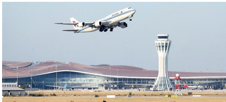
With the development of tourism in China and Egypt, the exchanges and cooperation between China and Egypt’s civil aviation industry are also increasing, Beijing Daxing International Airport.

Moreover, cultural exchanges between China and Arab countries need to keep pace with the times by incorporating new technologies and platforms. With the rapid development of technology, especially with the continuous emergence of social networking sites that affect people’s views and positions, China and Arab countries must pay attention to the role of the internet in non-governmental exchanges. In China and the Arab world, hundreds of millions of citizens are using the internet, including social networking sites that influence public opinion, such as micro-blogs, WeChat, Facebook, YouTube, etc. The number of Arab citizens using WeChat to communicate both with their Chinese friends and each other has been increasing. The Embassy of China in Egypt and other Arab countries began to build a WeChat official account while some embassies opened micro-blog accounts. New media will become a key platform for cultural exchanges between China and Arab countries in the future.