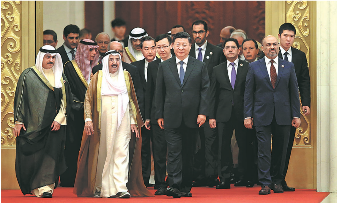
Cultural exchange between China and Arab countries primarily relies on top-level government action. (Feng Yongbin /China Daily, 2018)

China-Arab cultural exchanges consist of educational, media, tourist, and religious interactions. The first focuses on elite and intellectual exchanges; the second aims to influence public opinions of the target countries; the third aims at better understanding between the mass; the fourth attempts to influence religious groups between Chinese and Arabs. The following are the operations and cooperation areas for cultural exchanges between China and Arab countries.